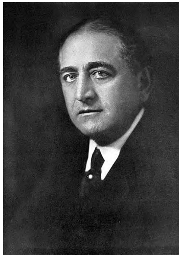
Adolph S. Ochs

Adolph Ochs' speaking engagement at Silver Bay and his experience on the Crusader , were not his first connection to Lake George. A man of great accomplishment and wealth, in the early 1900's he purchased the "Abenia" estate from George Foster Peabody, a noted American financier and philanthropist with strong ties to the Lake George region. It is said that "Abenia" is an Algonquin name meaning "home of rest," as indeed it was for Mr. Ochs. When residing here on Lake George, Ochs made multiple calls a day to the city offices of The New York Times . But he also participated in golf, had an active social life with his friends and neighbors, and was a long-time