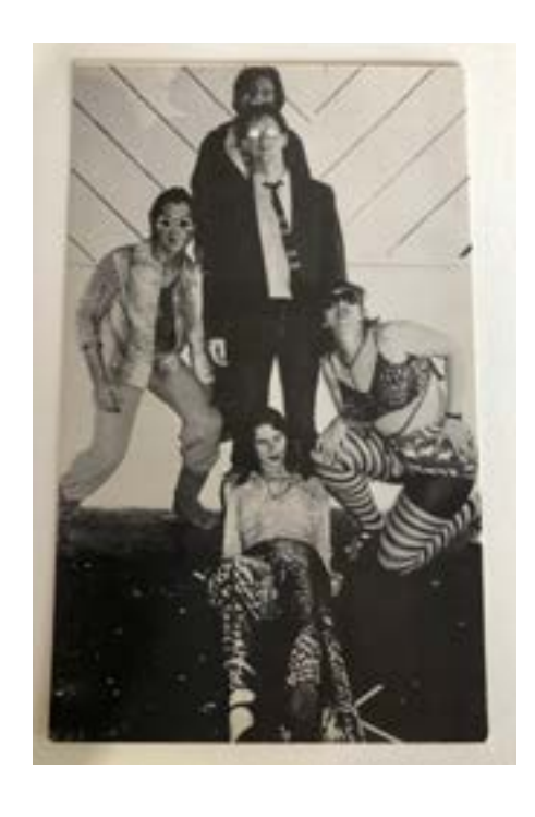
I will have a punk postcard in a show at the Brooklyn Museum in 2024 in a Networks exhibit.

It's been a busy couple of years since I was at Dorland last.