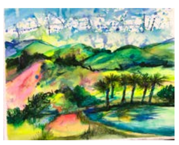
Fantasy Phantom Palms watercolor from stay at Chateaux Orquevaux 2021