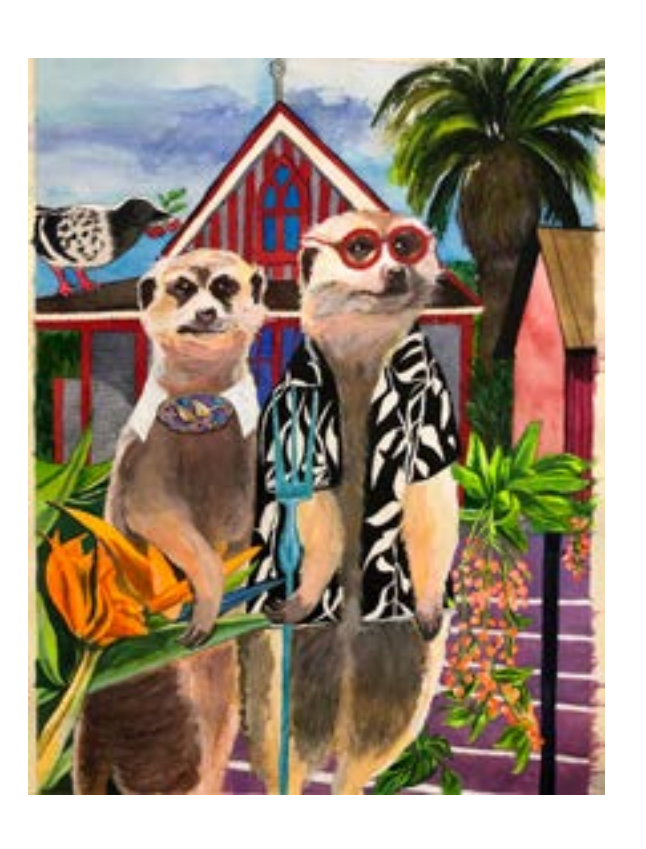
American Gothic Meercats, watercolor