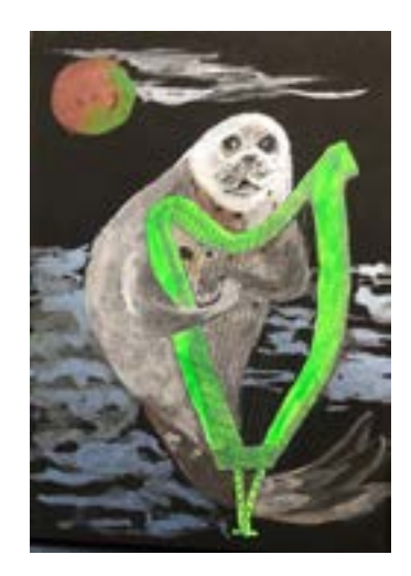
Harp Seal, small watercolor on black paper sold to Erik Walker 2022