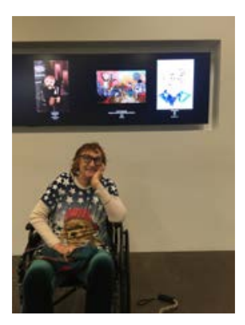
Me with digital image of my painting Exactly the Same but Completely Different , the Alice Neel show at the DeYoung museum 2022