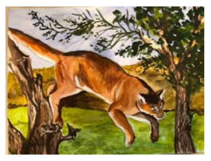
Leaping Puma watercolor sold to the Marmons as a result of Dorland stay