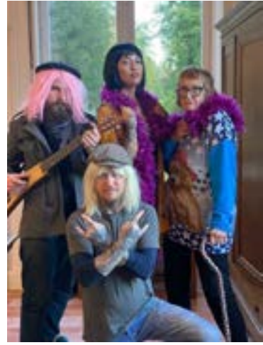
Hamming it up at Orquevaux in 2021, faux rock band