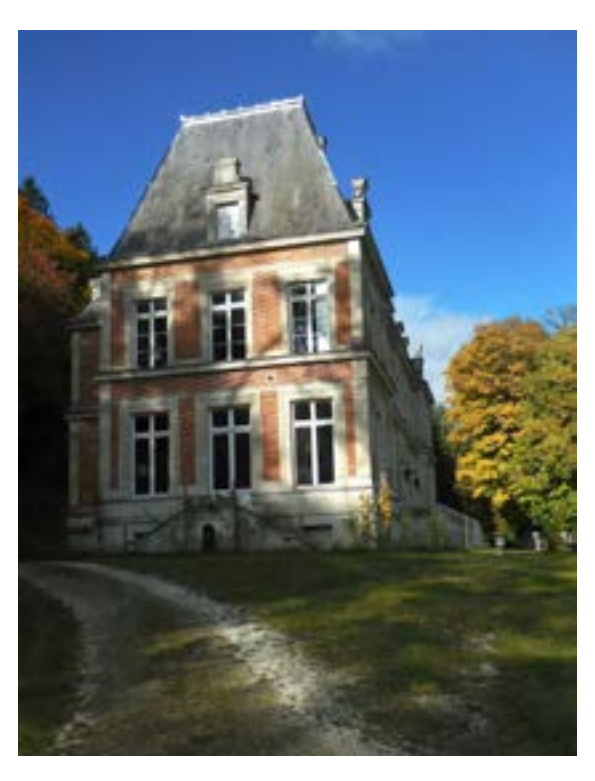
In October of 2021, I attended a residency at Chateaux Orquevaux for a month. Chateaux Orquevaux from my stay there