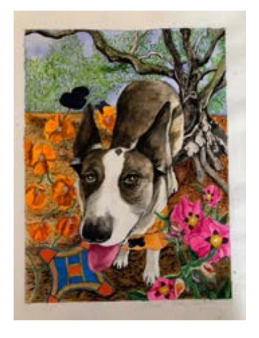
ChuChuck, watercolor dog portrait