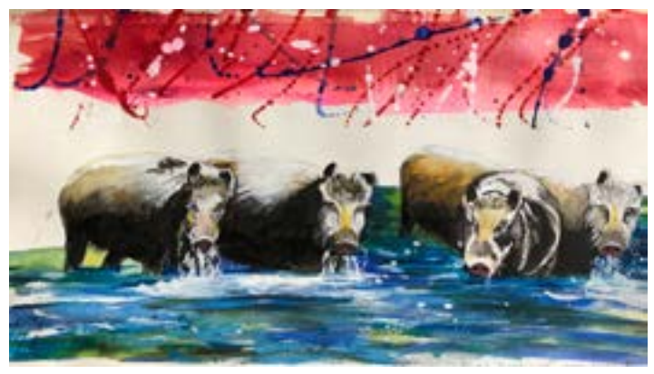
Les Caprices, kept by Orquevaux for their collection, watercolor on paper