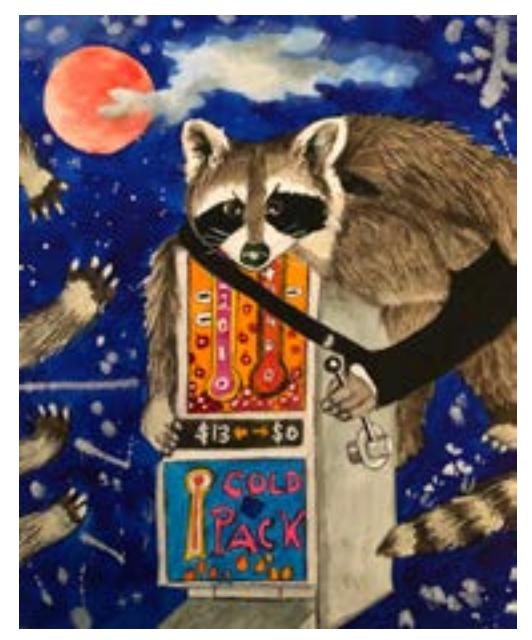
One-Arm Bandit, Mixed media watercolor 14" x 11" 2023 done after I broke my elbow in June