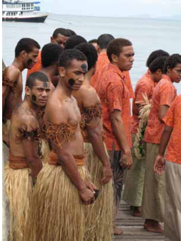
Fijian youth in traditional attire, Suva, Fiji