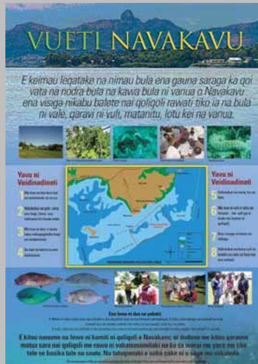
Box 5: Simple management plan for Navukavu village, Viti Levu, Fiji

Customary governance is the primary mechanism for regulating the use of terrestrial and marine resources and specifically ICCAs. Respect for customary law and institutions is an integral feature of rural life, and even where state institutions exist at the local level, they co-exist with customary institutions in Fiji (Clarke and Jupiter 2010) and much of the rest of the Pacific (NZLC 2006).