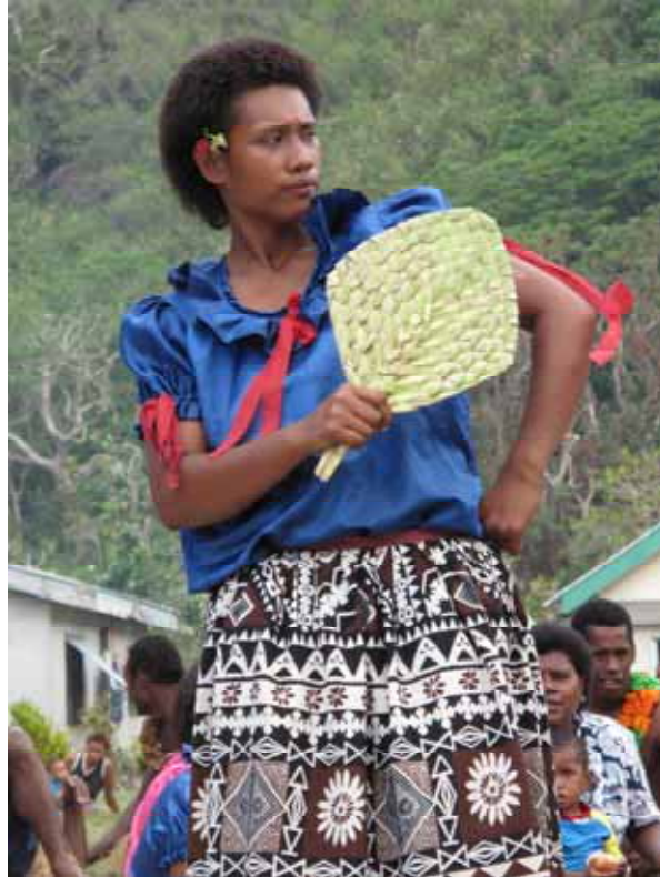
Fijian woman performing a traditional meke dance, Waya Island, Yasawa Group