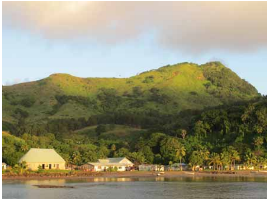
Sun setting on the remote village of Tovu, Totoya Island, Fiji

The Fijian relationship between people and their land and sea, the vanua , is traditionally defined among other things as the duty of care that people have to each other, the future generations, as well as the environment (Govan et al. 2009a). Traditional approaches to conserving resources for consumption have long been practiced through initiatives such as setting aside areas or species from hunting, fishing or gathering to build up quantities of food or other resources for special occasions (Veitayaki 1997). Such approaches are generally known as tabu (see Box 1). Some places or plants or animals were forbidden to some people, but this was for cultural or spiritual reasons rather than explicitly for conservation. These approaches to resource use continue in parts of Fiji today and are sometimes used as the basis for modern community conservation initiatives (Lees and Siwatibau 2007).