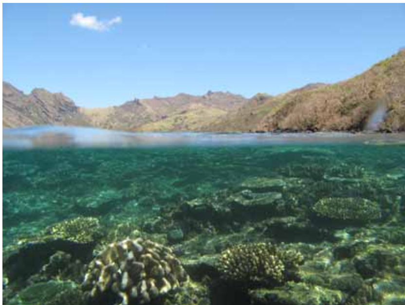
A ridge-to-reef seascape from Waya Island, Fiji

In the 1990s, residents of villages such as Ucuivanua in Verata, Tailevu, Cuvu in Nadroga and Waisomo in Ono, Kadavu, began re-implementing customary bans on harvesting to stem perceived declines in resources within their i qoliqoli . By 2001, these local practitioners, together with government and non-government partner organizations, had organized themselves within the Fiji Locally Managed Marine Area (FLMMA) network to “ promote and encourage the preservation, protection and sustainable use of marine resources in Fiji by the owners of marine resources ” (Govan 2011). Under the FLMMA umbrella government, universities and NGOs successfully promoted and supported ICCAs known as LMMAs progressing rapidly from 1 in 1997 to approximately 149 LMMAs in 2009, with at least 216 tabu areas. In total the LMMAs and tabus covered, respectively, about 60% (approximately 17,726 km 2 ) and 2% (approximately 567 km 2 ) of the total extent of traditional fishing grounds (Mills et al. 2011a). The FLMMA experience has achieved some mainstreaming through its recognition by Fiji Government, including the Departments of Environment and Fisheries, as the optimal forum for practitioners, researchers and government officials to learn how community-based marine conservation can be implemented on local and national scales