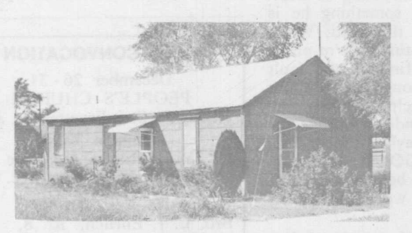
Original Building of Arnett Apostolic Church

Any information which the readers of the "Report" can send to the church here would be greatly appreciated. Please address all your letters to — Apostolic Faith Church, Box 161, Arnett, Oklahoma 73832.