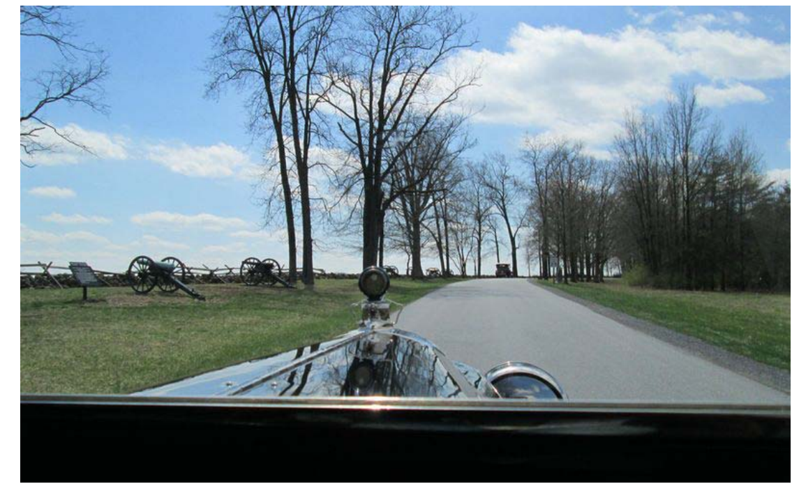
A view of the battlefield from behind the wheel