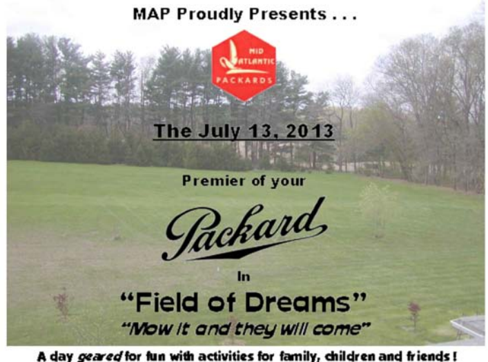
A day geared for fun with activities for family, children and friends ! • Enjoy morning tea with Ross Miller at 10 AM