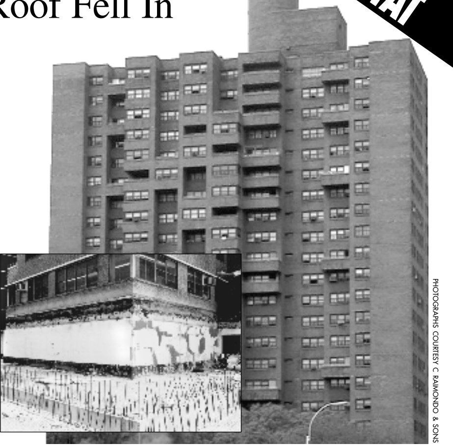
THE BUILDING (top) AND THE REPAIRS (inset): "The board didn't go forward."

The 11-member board had been in office for years, running on staggered