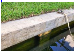
New requirements coming

Your seawall is something that rarely gets any thought, but is a critical part of the infrastructure of your property. Due to requirements established by Broward County, the City of Fort Lauderdale is changing its requirements for Tidal Barriers, which in our neighborhood is our seawalls. Am I now required to increase the height of my seawall? Repairing or replacing a seawall is a very expensive proposition.