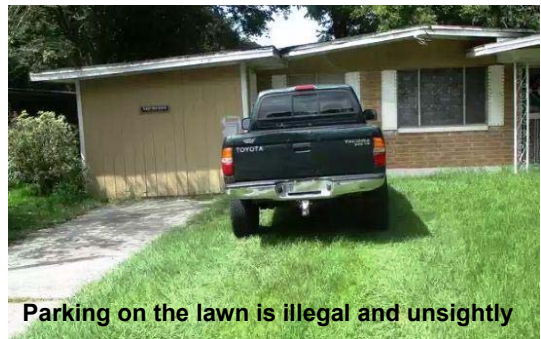
Parking on the lawn is illegal and unsightly

You can imagine visitors to our neighborhood seeing cars on the lawn sets the wrong tone and makes it even tougher for our Code Officers to cite the vacation rental. Remember, three citations may result in the vacation rental losing its certificate to operate for 180 calendar days. Please remind your neighbors to at least park parallel to the road and not on the front lawn to prevent a citation from Code.