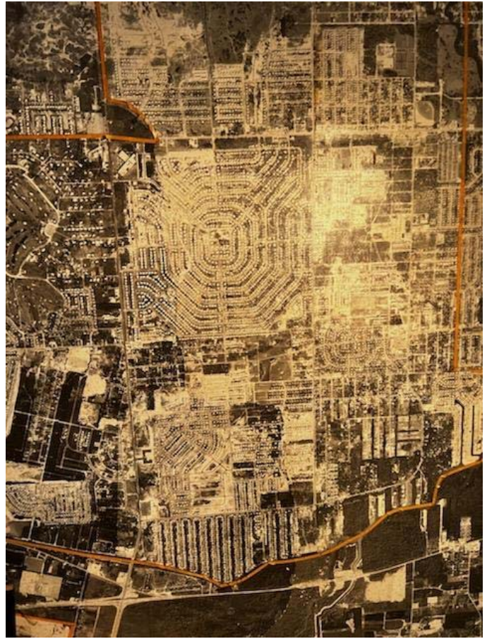
1958 aerial photo. The ten canals of Lauderdale Isles are plainly visible bottom center. SR7 was the main north/south route. I-595 wasn't built yet.

Because I-95 didn't exist in 1958, Clive mentioned that the main route to Miami was State Road 7. According to Clive, kids of the 1970's loved riding to the Duck Pond in Plantation. This park still exists as a part of Plantation Heritage Park and one of the pavilions is built around the former summer home kitchen floor of the Peters Family.