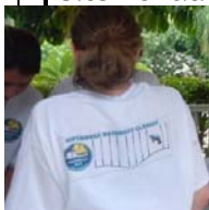
OUR T-SHIRTS ARE COLLECTOR'S ITEMS

Site Location: Riverland Woods Boat Ramp. You must pre-register for this event—see below.