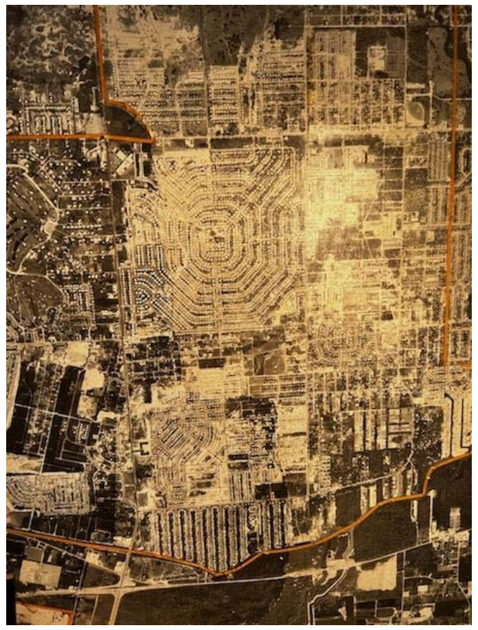
1958 aerial photo. The ten canals of Lauderdale Isles are plainly visible bottom center. SR7 was the main north/south route. I-595 wasn't built yet.

Because I-95 didn't exist in 1958, Clive mentioned that the main route to Miami was State Road 7. According to Clive, kids of the 1970's loved riding to the Duck Pond in Plantation. This park still exists as a part of Plantation Heritage Park and one of the pavilions is built around the former summer home kitchen floor of the Peters Family.