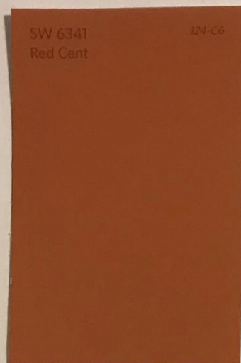
SW 6341 Red Cent