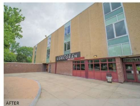
Corcoran – Main Entrance