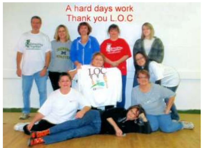
10 of the 12 wonderful volunteers from LOC Federal Credit Union.

2nd Vice Terry Montgomery lead the project, and with the help of Jim Koponen, Gary Fierk, Jim Forbes and 12 dedicated volunteers from LOC, we are well on our way to a beautiful, bright, clean, and very rentable banquet room! Even more improvements are still coming, if you haven't seen the job yet, stop by and take a look. Remember the Post for your next hall rental opportunity, spread the word!