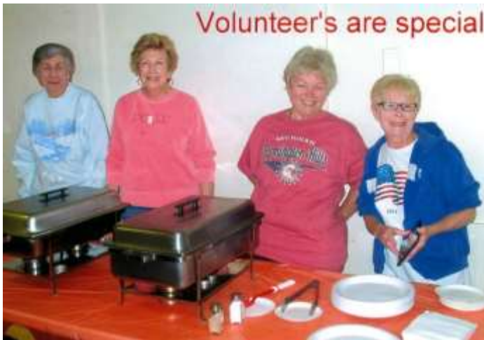
Our special Auxiliary volunteers served Spaghetti and all the fix'ins to the homeless vets from the MI Veterans Foundation.