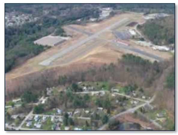
Claremont Municipal Airport