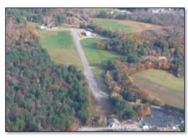
Newfound Valley Airport

airport if allowed by FAA Grant Assurances.