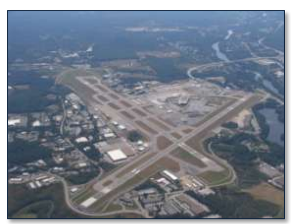
Manchester-Boston Regional Airport