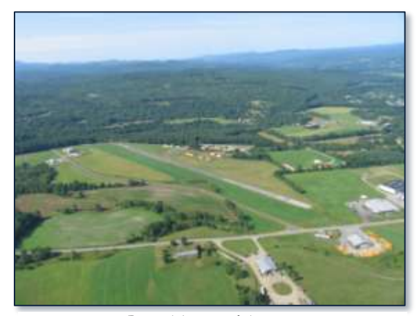
Dean Memorial Airport