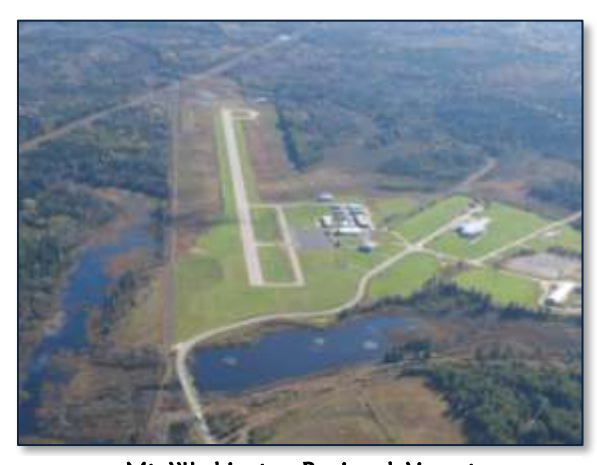
Mt. Washington Regional Airport