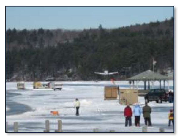
Alton Bay Ice Runway