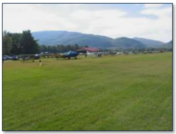
Northeast Delta Pilots Annual Fly-In at Plymouth Municipal Airport

airport infrastructure funding needs during the congressional recesses.