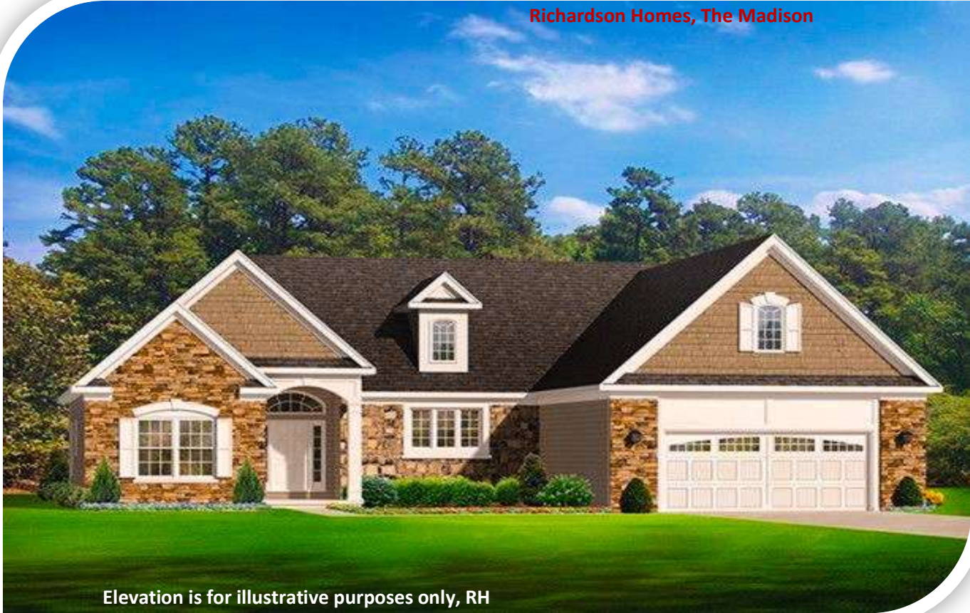
Elevation is for illustrative purposes only, RH