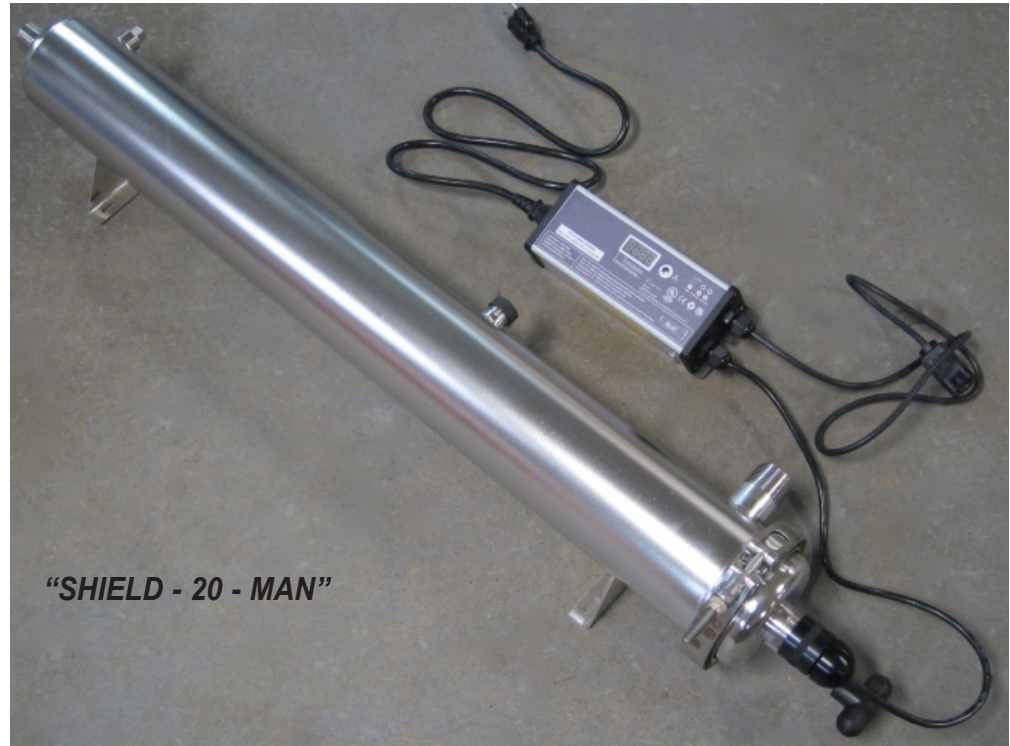
“SHIELD - 20 - MAN”

The GUV SHIELD MAN system comes with an integral manual quartz sleeve wiping system. A manual wiping system helps remove build up on the protective quartz sleeve. Fouling occurs when the water has impurities like minerals. High iron and hard water can coat the quartz sleeve and interfere with the proper transmission of UV light.