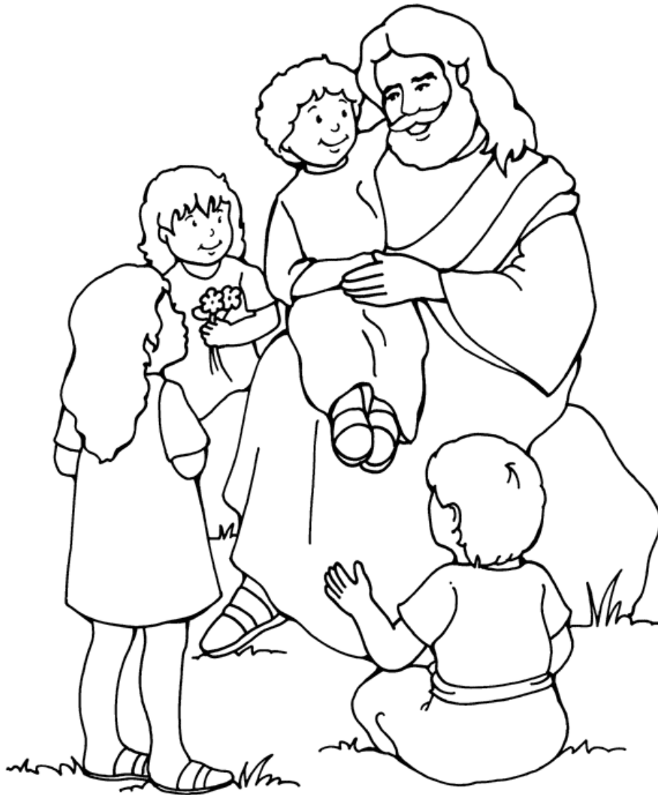
Jesus and the Children

From Thru-the-Bible Coloring Pages for Ages 4-8. © 1986,1988 Standard Publishing. Used by permission. Reproducible Coloring Books may be purchased from Standard Publishing, www.standardpub.com, 1-800-543-1301.