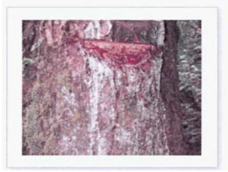
Figure 9-Pitch bleed from a cut on a tree.

that contain oxalic acid will likely be effective for removing WSE. Oxalic acid will also remove iron stains and help brighten the wood surface. (Caution: Oxalic acid is poisonous; take safety precautions. Wear eye protection and avoid contact with skin. Cover plants to shield them from cleaners.)