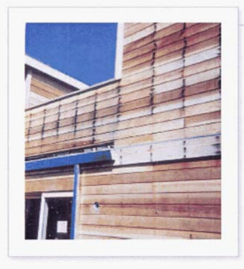
Figure 8 – Iron stain on newly constructed home. The intent of the owner was to have a natural finish (lightly pigmented semitransparent stain) on the siding. To correct this, the siding will need to be replaced.

If WSE bleed does occur, it will usually be washed away during rainfall and will not cause discoloration. If WSE accumulate in areas that are not washed by rain. it may be necessary to use a cleaner to remove them. A number of commercial cleaners are available in paint stores for cleaning wood and painted wood. Before buying a commercial cleaner, by soap and water. Use a non-metallic bristle brush to lightly scrub the surface and rinse well; if this does not suffice, use a commercial cleaner. Cleaners