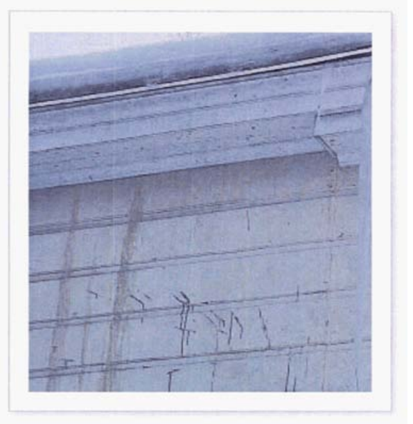
Figure 4 - Ice dam on roof and gutter. The resulting water intrusion into the wall and behind the siding often causes rundown extractive bleed.