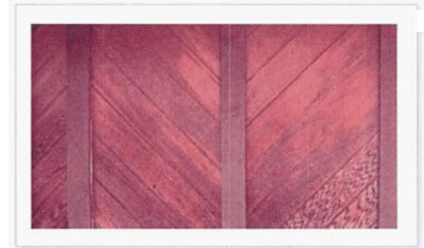
Figure 5 - Uneven extractive bleed on siding.