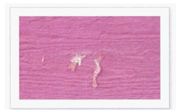
Figure 10-localized pitch bleed.

Unlike WSE bleed, in which water is the main and rather predictable culprit, SSE bleed occur via two disparate mechanisms. The first and most readily understood mechanism is analogous to the diffused extractive bleed seen with WSE. Specifically,