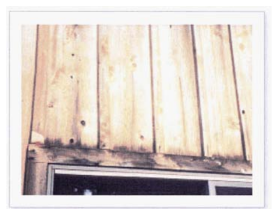
Figure 3 — Extractive bleed from end-grain adsorption of water. Note the fasteners have also caused iron staining.