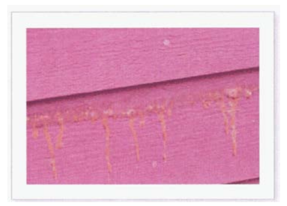
Figure 11 - Large pitch pocket or seam.

the carrier solvent in a solventborne finish moves into the wood during finishing and while the finish is curing. the solvent volatilizes, pulling extractives to the surface of the wood. This particular form of SSE bleed is rare. The second and much more common mechanism of SSE bleed is known as pitch bleed. Pitch bleed is the bulk flow of large volumes (compared with volumes of WSE) of pitch or resin to the surface