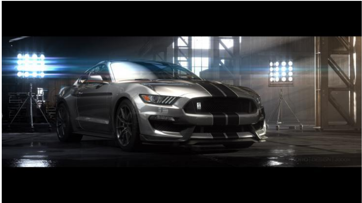
New GT350 Concept