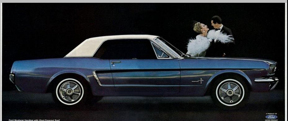
Ford Mustang Hardtop with Vinyl-Covered Roof