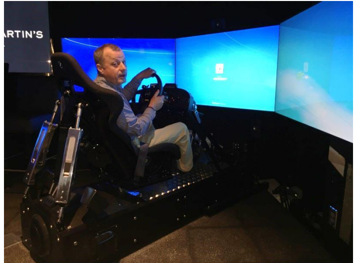
Yours Truly at the Driving Simulator

RMM: What kind of parking is available for club members? For example, if I want to drive my 1970 Mustang Mach 1 to the club, I'd like a safe and secure place nearby to park. (Of course, I'd have to finish the restoration of my Mach 1, but that's another story. A very long story...)