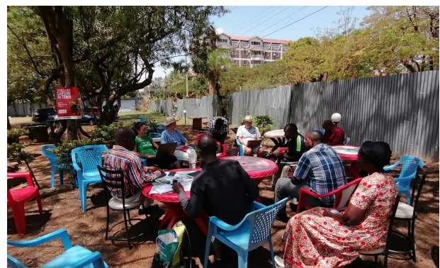
Initiatives such as the Kisumu Waste Actors Network (KIWAN) must be encouraged to ensure the engagement and inclusion of waste collectors, recyclers, community organizations and entrepreneurs.