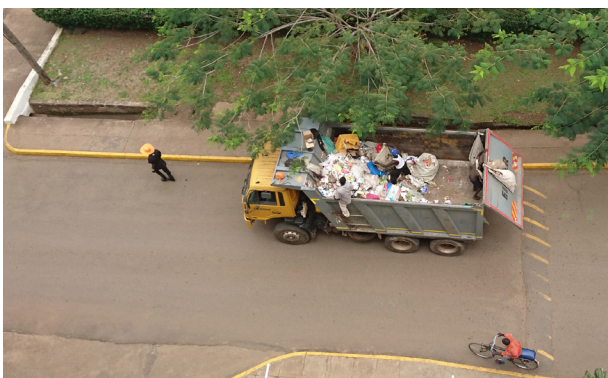
Collection truck owned by the municipality of Kisumu - even if households sort their waste, the trucks are not well-suited for keeping the fractions separated.

compromise long-term goals, but should focus on increasing socio-economic and environmental sustainability. For the strategy to be successful, interventions must be done systematically and jointly at all waste management steps, and not isolated from each other.