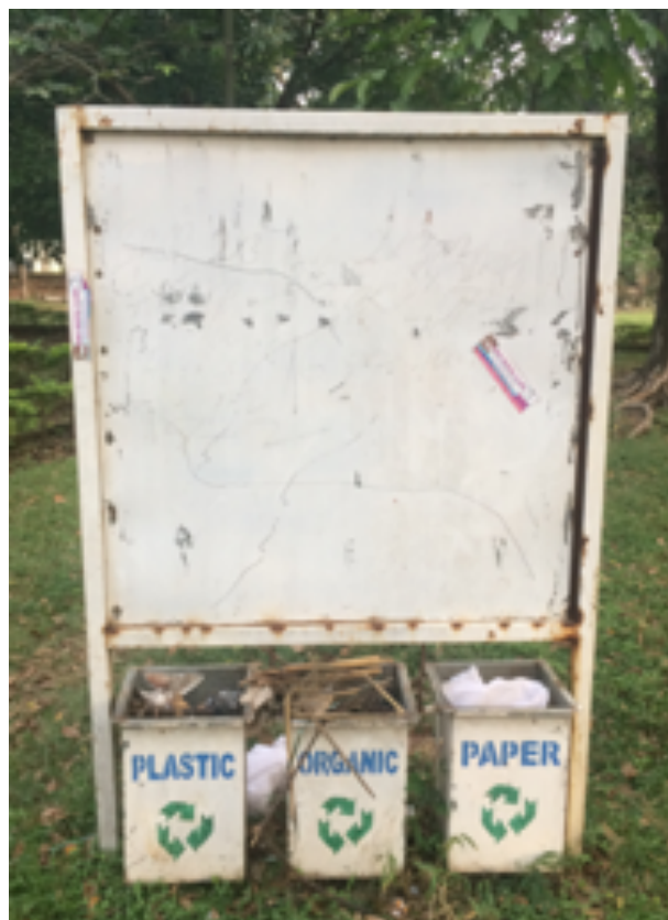
Public park separation containers that could be revived and used for the information campaign.

For a sustainable solid waste management strategy to achieve its goals, waste separation at source is imperative. This strategy will help reduce waste that reaches final disposal. In addition, it will also reduce labour requirements for separation waste resource entrepreneurs and increase the value of the resources. Its success requires the involvement of the entire citizenry of Kisumu, government actors, local leadership and institutions such as residence associations and Nyumba Kumi (Know Your Neighbour). The waste collection chain must be adapted to be able to receive and ensure that these materials sorted until they reach their destination, avoiding contamination of recyclables. Furthermore, it is essential that a communication strategy and campaign is established to raise awareness. This should involve use of multiple effective means of communication such as radio, print media, TV and social media. More importantly, it should target children and youth in schools and tertiary institutions of learning in the region through demonstration of best management practices. Finally, hands-on public programmes to promote solid waste separation should be revived and/or initiated and followed through in public spaces such as recreation parks and city hall targeting general population.