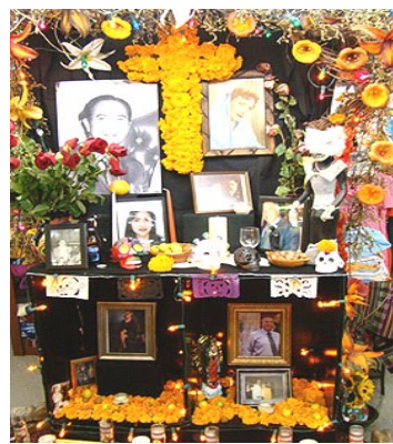
Tableau Of Deceased in November

During the month of November, "All Souls Month", the Church commemorates her faithful departed. As we did in previous years, St. Mary's will ritualize this with a Tableau to the Deceased