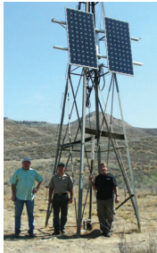
Solar pump for a wildlife water hole funded with donations and installed by volunteers.

The Chimineas Ranch needs your support. The maintenance of the conservation education facility, support for biological studies, sustaining fragile ecosystems, enhancement of critical habitat, increased access for compatible recreational activities and the preservation of the history and ranching heritage of this great property is dependant upon your donated dollars.