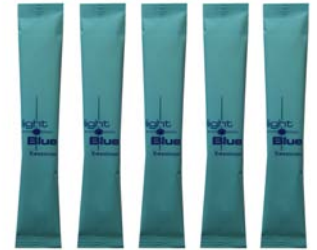
The Blue Sweetener