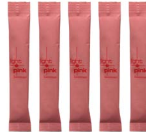
The Pink Sweetener