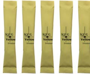
The Yellow Sweetener