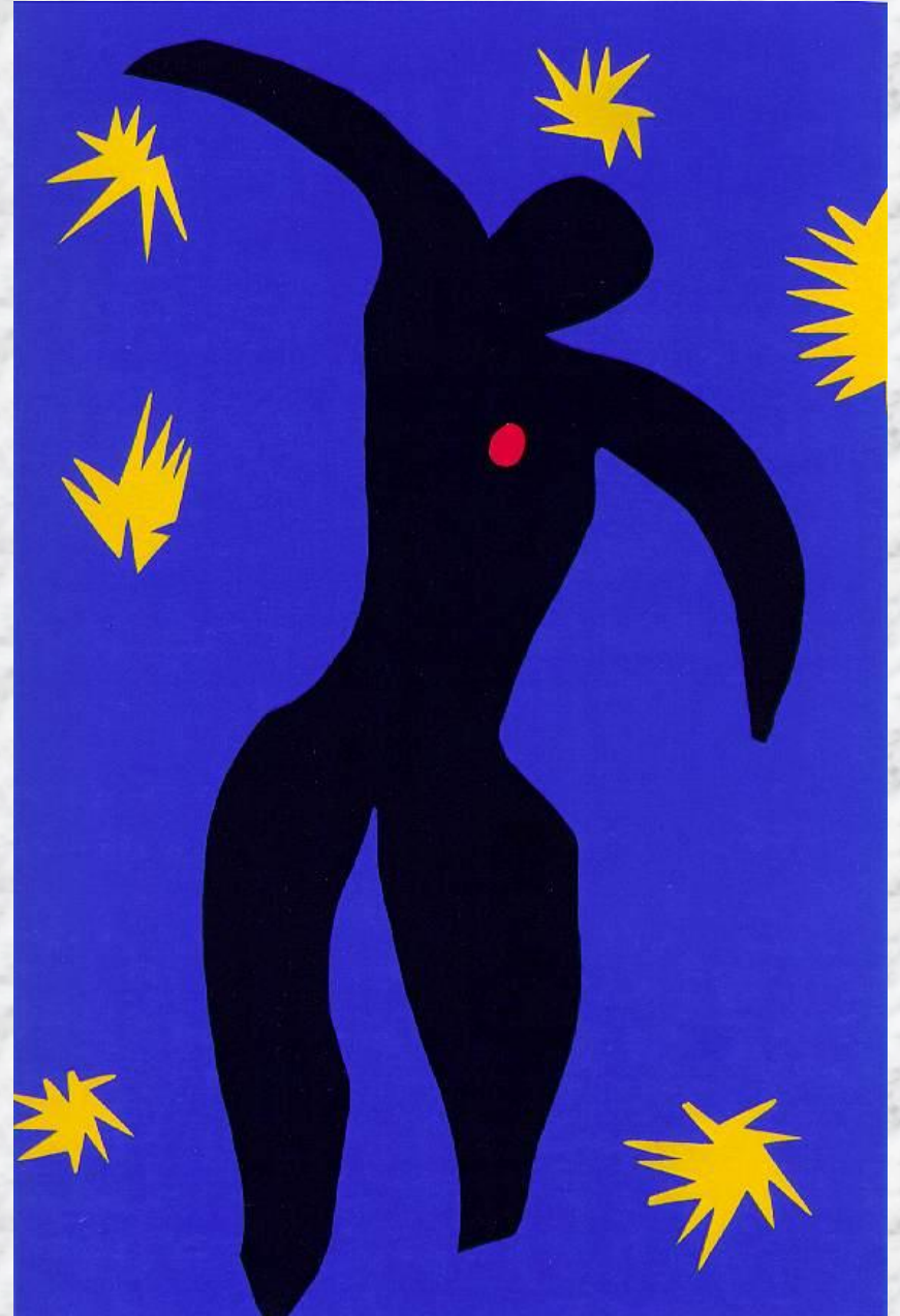
Henri Matisse, Icarus , 1946.