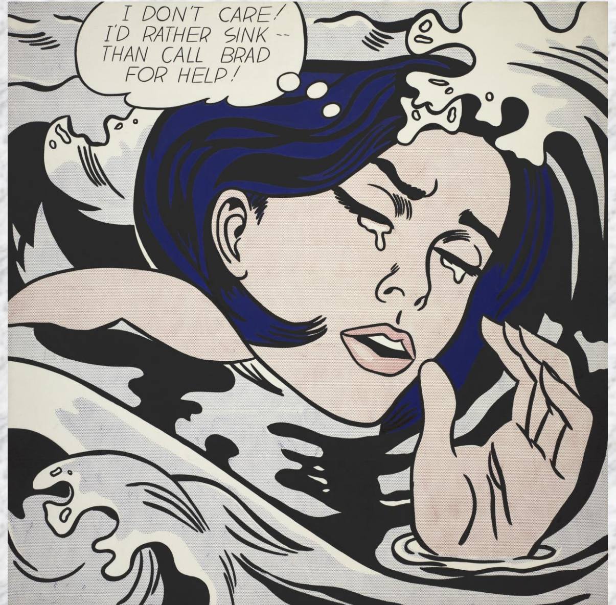
Roy Lichtenstein, Drowning Girl , 1963. MoMA

Ernest Hemingway, A Farewell to Arms , 1929.