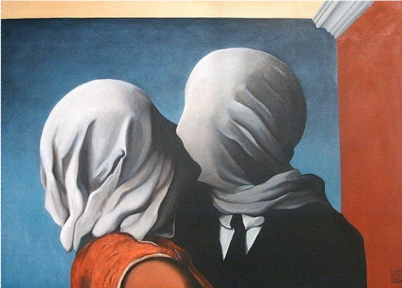
René Magritte, The amants , 1928.