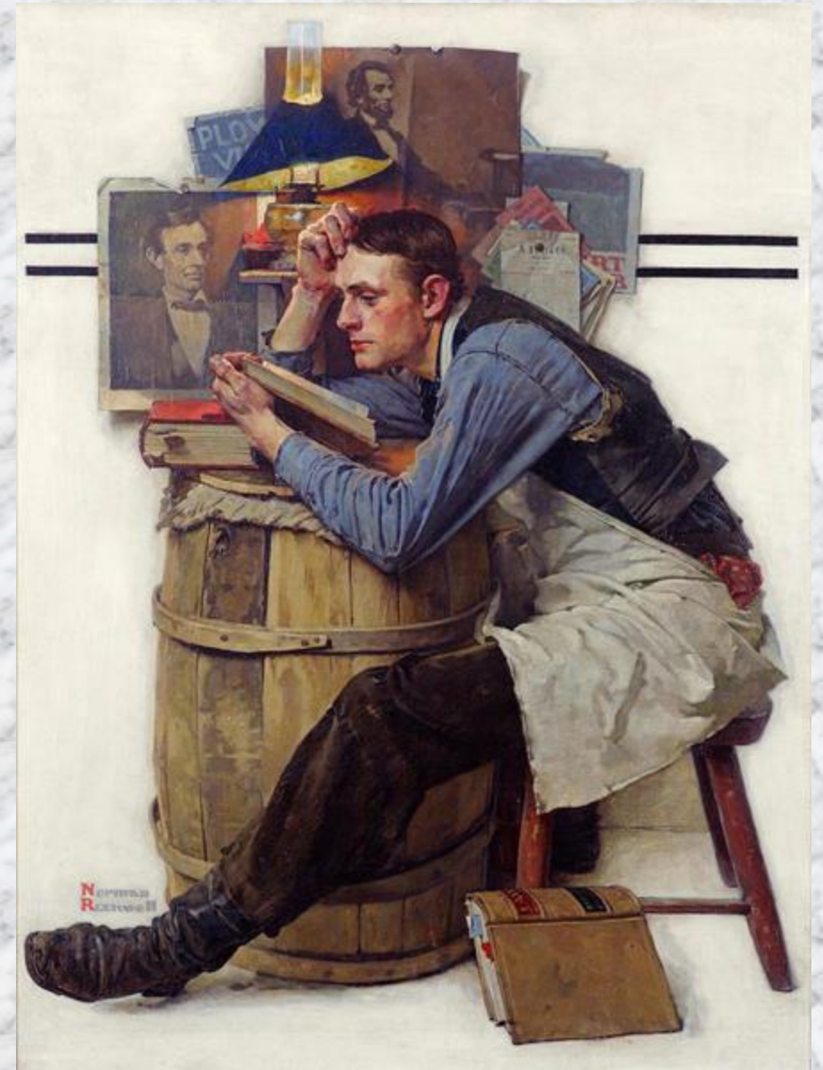
Norman Rockwell, Law Student (Young Lawyer) , 1927. Saturday Evening Post cover.

See Indeed.com/career-advice/careers/what-does-an-attorney-do ; Industrial Commission website; https://www.careerexplorer.com/careers/judge/