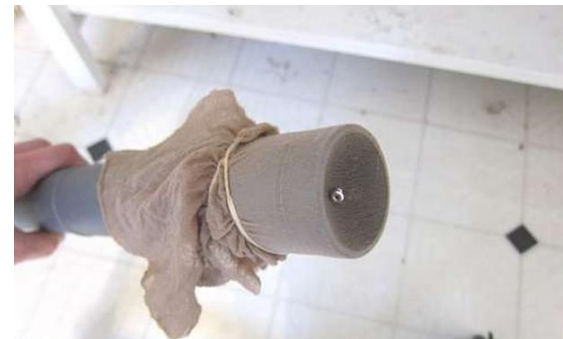
PUT A STOCKING OVER THE END OF A VACUUM TO FIND TINY ITEMS LIKE EARRINGS