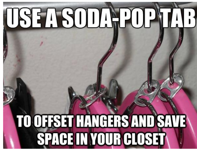
USE A SODA-POP TAB TO OFFSET HANGERS AND SAVE SPACE IN YOUR CLOSET