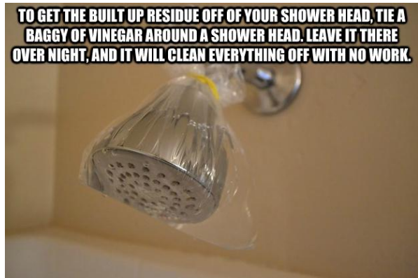
TO GET THE BUILT UP RESIDUE OFF OF YOUR SHOWER HEAD, TIE A BAGGY OF VINEGAR AROUND A SHOWER HEAD. LEAVE IT THERE OVER NIGHT, AND IT WILL CLEAN EVERYTHING OFF WITH NO WORK.