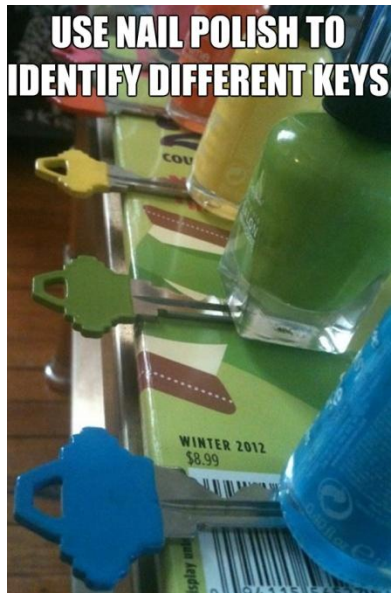
USE NAIL POLISH TO IDENTIFY DIFFERENT KEYS