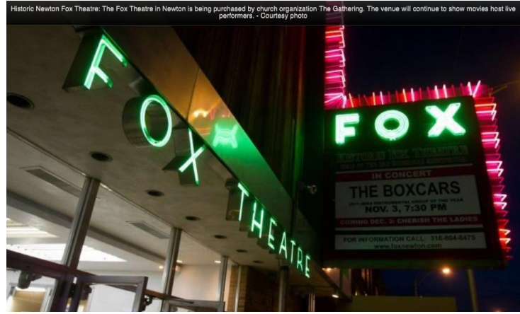
Historic Newton Fox Theatre: The Fox Theatre in Newton is being purchased by church organization The Gathering. The venue will continue to show movies host live performers.