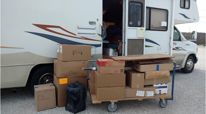
This was all transported in Penny's motorhome.