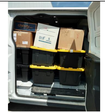
Never would have gotten everything to St. Louis without that big stinky van.