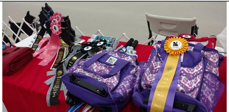
PSSC regular class trophy table.