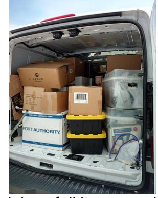
Look how full it was packed!