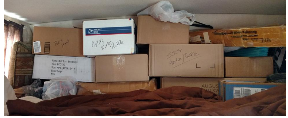
Penny shared her bed with many boxes.

Please enjoy these other random pictures from Schnauzapalooza '19. . .