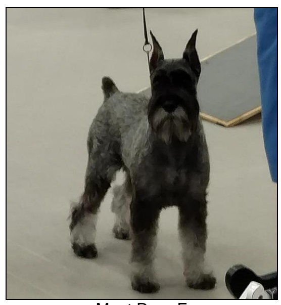
Meet Roar-E (Katon's Hear the Tiger Roar v Morgenwald)