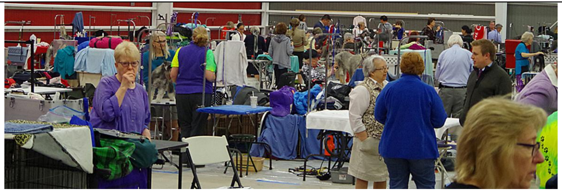
More grooming near the ring of Great Hall.