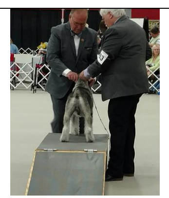
Using the ramp – new for our breed this spring.