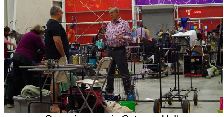
Grooming area in Gateway Hall.