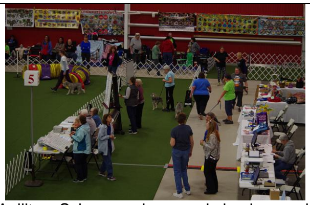
Agility – Schnauzer banners in background.