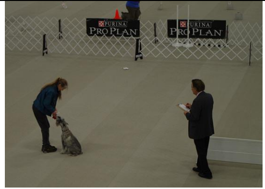
Obedience – Rally in the background.