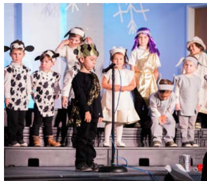
(Below) The Preschool/Kindergarten Christmas Program