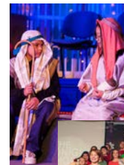
(Left and below) The First through Fifth Grade Christmas Play