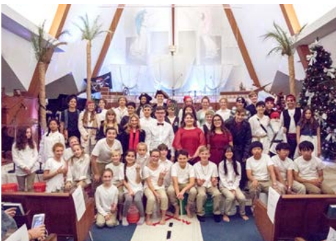
(Above) The Trinity Christian School sixth through eighth grade program was presented in the sanctuary.

rdebreau@trinitypres.org 619-465-3011 x107