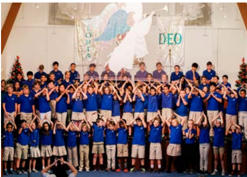
(Above) The all-school presentation for Presbyterian Women of San Diego County