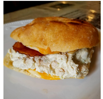
Garden Spot Melt