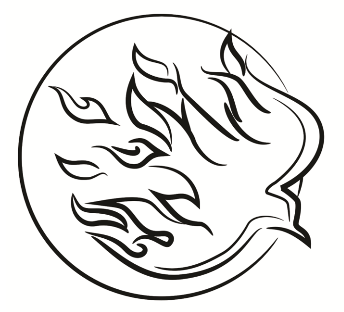
Sunday, May 15, 2016