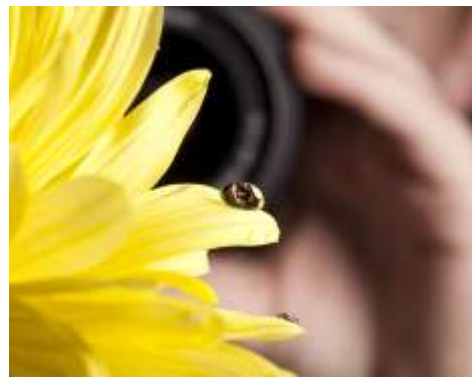
Photo must be a single print/digital image. Collages and collections of photos are not accepted. Entrant must be the photographer and may use a variety of digital editing techniques including but not limited to, multiple exposure, negative sandwich and photogram.