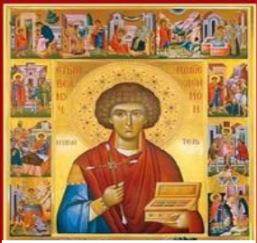
Gr. Martyr and Healer St.