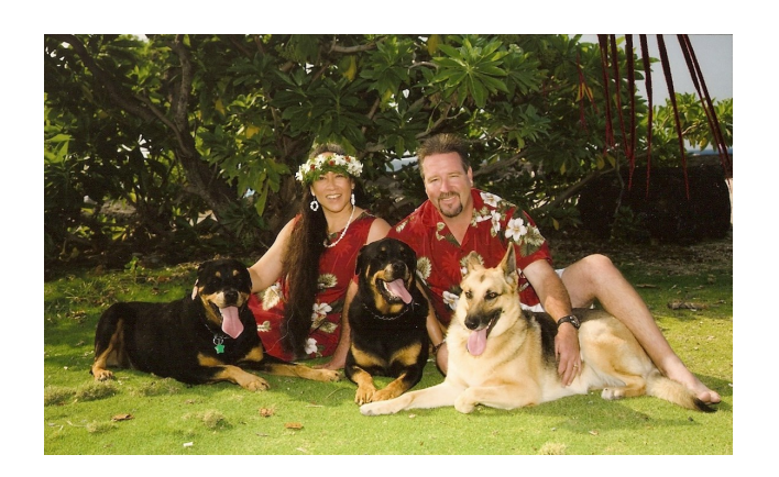
As They Are Trained, So Shall They Perform