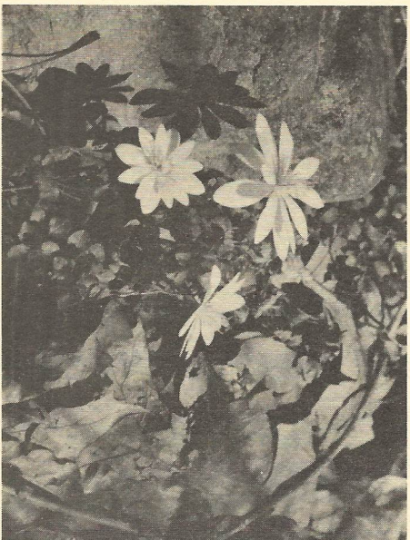
A wide variety of botanical specimens, such as the bloodroot, are among the attractions of the wilderness surrounding the Center.