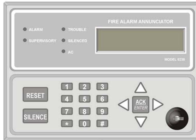
Figure 5-1 Model SK-5235 Remote Annunciator

To operate the SK-5208 you can use either the on-board touchpad or the Model SK-5235 Remote Annunciator.