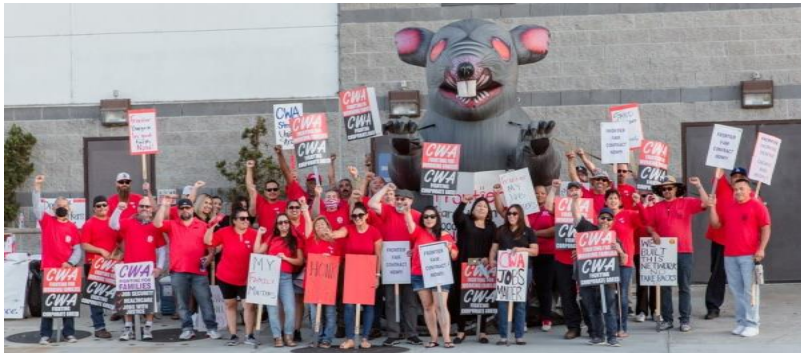
Huntington Beach Rally 2021

Please continue your mobilization efforts - the Company is hearing you. This is still a fight for a fair contract but all your united efforts are making an impact. We are in this together fighting for our future.