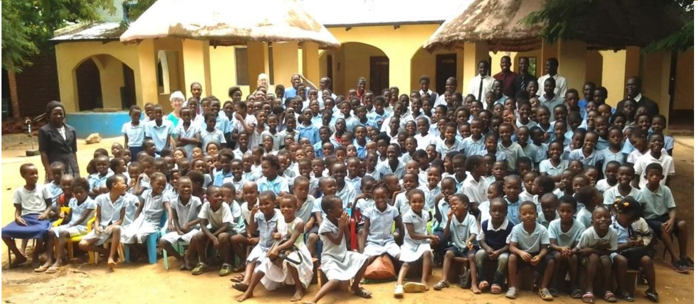
Tiyamike Mulungu Center Primary School Students and Teachers March 2016

Since 2003 - Our Goal- "Children's lives being made whole thru family"