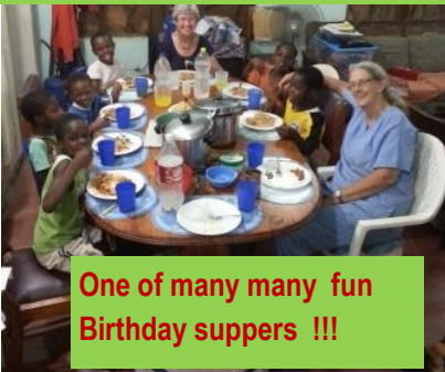
One of many many fun Birthday suppers !!!