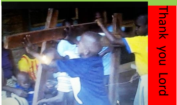
Thank you Lord

Jesus our God willing for the Cross obedient in all.