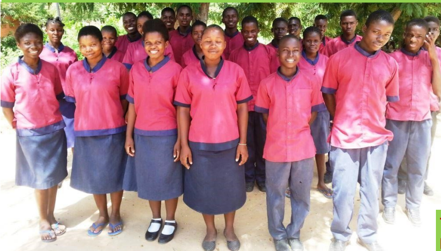
Tiyamike Mulungu Secondary School Students