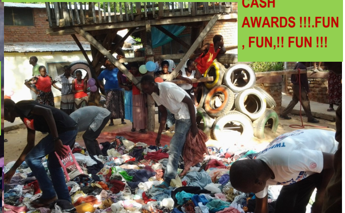
Give-away clothes and goods stored up for two years ...

Jesus our God willing for the Cross obedient in all.