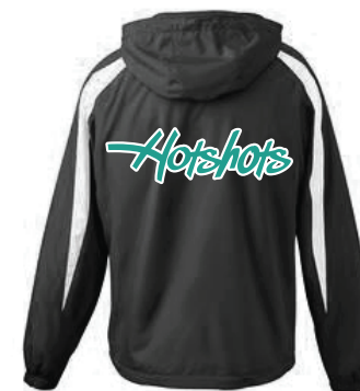
PJACK-BLK LOGO-TEAL ON WHI