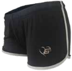
TheGluv Flex Short