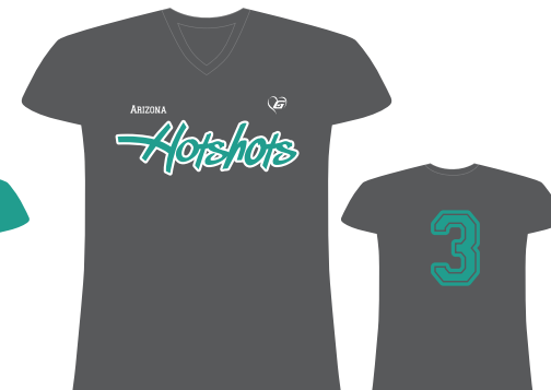
FJ-CHAR LOGO-TEAL ON WHI