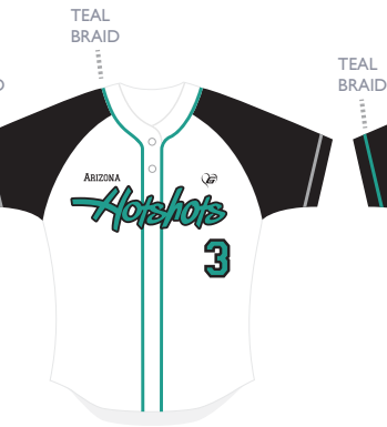
GREY BRAID TEAL BRAID G2UL-WHI/BLK BUTTON-WHI LOGO-TEAL ON BLK