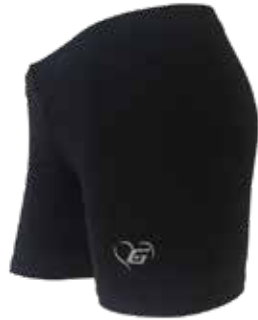
TheGluv Compression Short