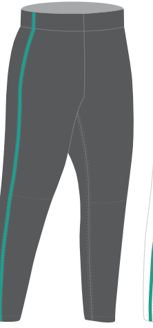
TGP-CHAR W/ TEAL BRAID