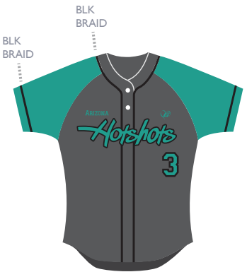
BLK BRAID BLK BRAID G2UL-CHAR/TEAL BUTTON-WHI LOGO-TEAL ON BLK