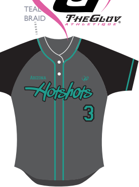
TEAL BRAID TEAL BRAID G2UL-CHAR/BLK BUTTON-WHI LOGO-TEAL ON BLK