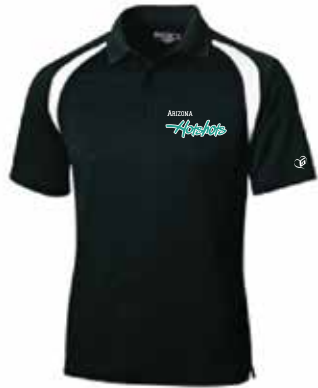
PS-BLK LOGO-TEAL ON WHI