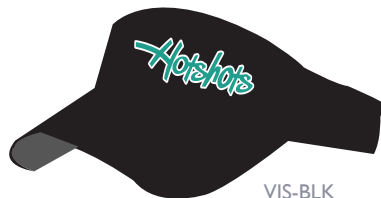
VIS-BLK LOGO-TEAL ON WHI

Athletic mesh sports visor. 100% polyester mesh with velcro closure. Logo embroidered. $18. Min one dozen