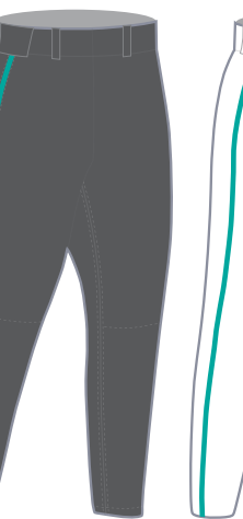
TGP-CHA BELT LOOPS W/ TEAL BRAID