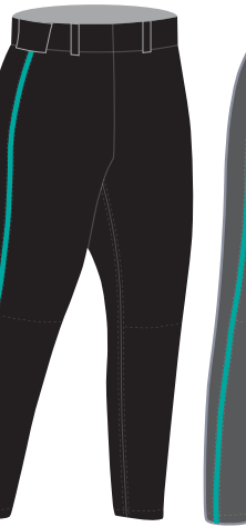
TGP- BLACK BELT LOOPS W/ TEAL BRAID