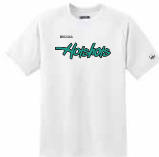
PS-WHI LOGO-TEAL ON BLK