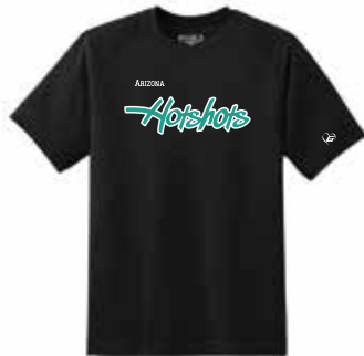
PS-BLK LOGO-TEAL ON WHI