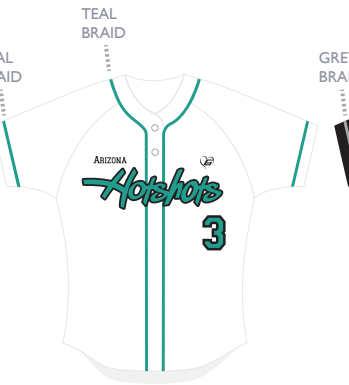
TEAL BRAID TEAL BRAID G2UL-WHI BUTTON-WHI LOGO-TEAL ON BLK