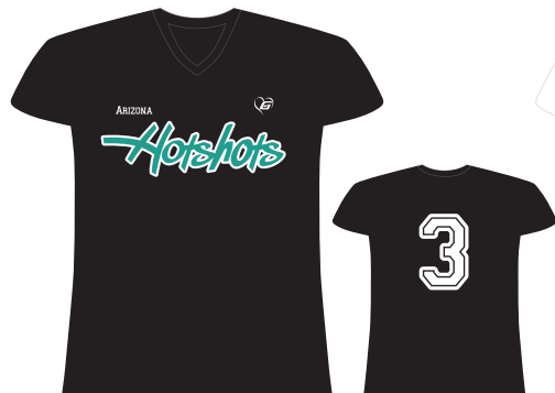
FJ-BLK LOGO-TEAL ON WHI