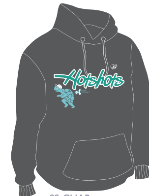
SS-CHAR LOGO-TEAL ON WHI