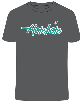
SS-CHAR LOGO-TEAL ON WHI