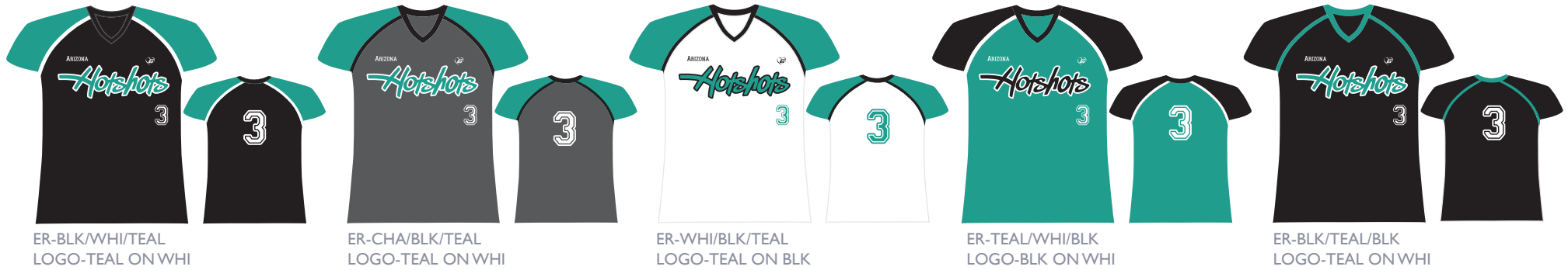
ER-BLK/WHI/TEAL LOGO-TEAL ON WHI