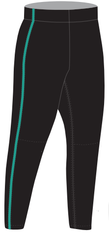
TGP-BLK W/ TEAL BRAID