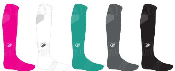
PNK WHI TEAL CHAR BLK

by TheGluv Athletique are designed for high performance athletes. They feature top ribbing above the knee to keep the sock in place, mesh panels located behind the upper calf for ventilation, upper and lower compression panels to provide ankle and foot support. Team Price starting at $12.