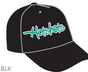
CAP-BLK LOGO-TEAL ON WHI

This FlexFit® cap wicks sweat like a champ. Made from 84/14/2 nylon/cotton/spandex. $23. Min one dozen