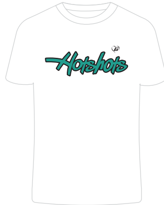
SS-WHI LOGO-TEAL ON BLK