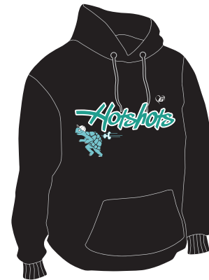
SS-BLK LOGO-TEAL ON WHI