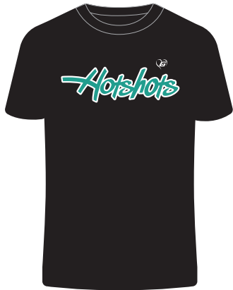
SS-BLK LOGO-TEAL ON WHI