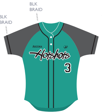
BLK BRAID BLK BRAID G2UL-TEAL/CHAR BUTTON-WHI LOGO-BLK ON WHI