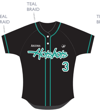
TEAL BRAID TEAL BRAID G2UL-BLK BUTTON-WHI LOGO-TEAL/WHI