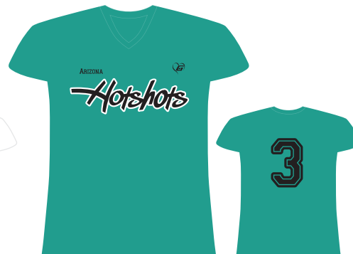
FJ-TEAL LOGO-BLK ON WHI