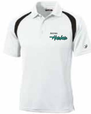
PS-WHI LOGO-TEAL ON BLK

Sport-Tek® Coach's Polo (minimum order of 4 per color)