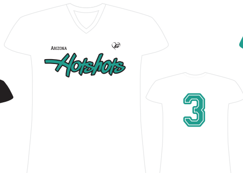
FJ-WHI LOGO-TEAL ON BLK