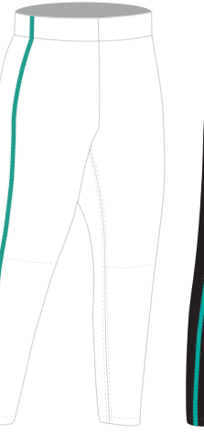
TGP-WHI W/ TEAL BRAID