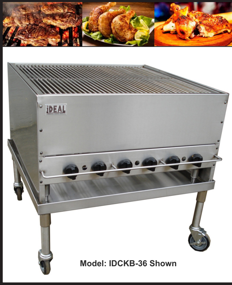
Model: IDCKB-36 Shown

Gas: 3/4" NPT rear gas connection, specify type of gas and altitude if over 2,000 feet. Pressure: 5" W.C. - Natural Gas 10" W.C. - Propane Gas Note: Install the supplied gas pressure regulator at the inlet of the gas line.