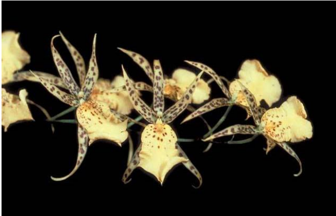
Brassidium Nittany Gold