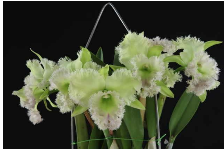
A sibling to one of our Christmas plants Rlc. Golf Green 'Hair Pig'JC/AOS (C. Moscombe x Rhy digbyana). Our plants will look similar and may even be better!

February 10, 2019 Second Sunday - Show Thank You Party & Critique of Show.