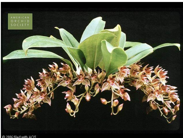
Thecopus secunda, species found from Borneo to Malaya, small growing. Plant in a basket so the flowers can hang down over the edges.