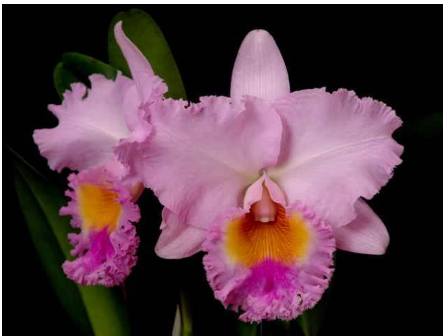
Blc Hawaiian Effect