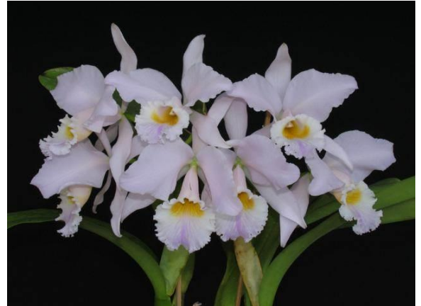
Cattleya labiata var amesianum