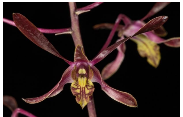
Dendrobium Tiny Twister