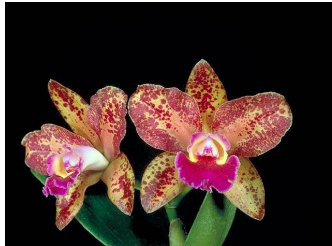
Lc. Waianae Leopard