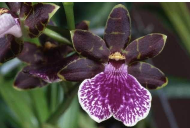
Zygo Blue Blazes