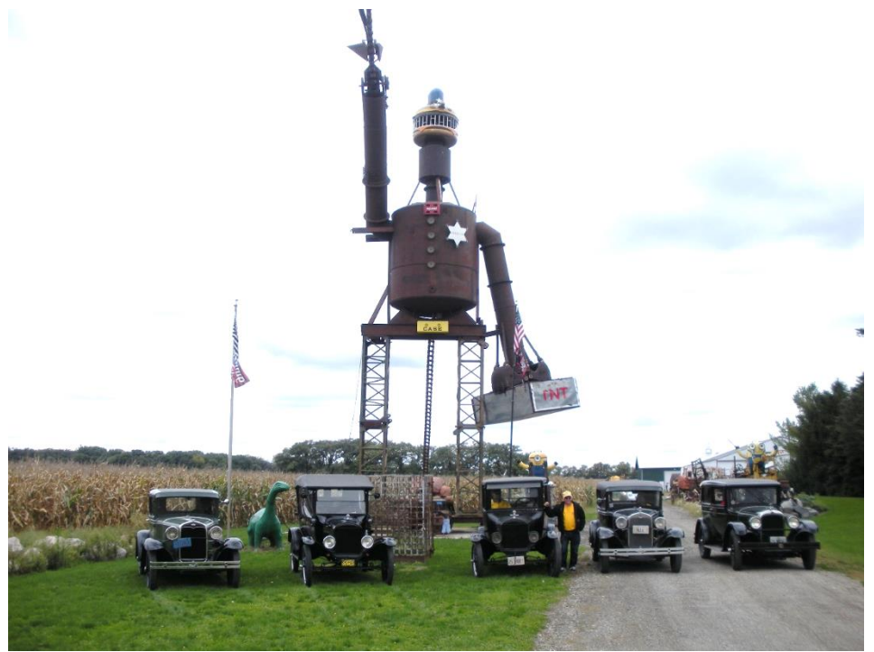
"Tin Man" takes yard art to a whole new height (and weight)! The sculpture is 40' tall and tips the scales at 40,000 pounds. The main body is made from a water tank that came out of the Pabst brewery in Milwaukee. The head is an "Officer Big Mac" and the feet are a set of Caterpillar tracks.

Off again without a worry in the world, we drove wonderful roads for a while until we found ourselves staring at a giant 40 plus feet tall Tin Man in the middle of nowhere. Actually, we were just a couple of miles on the outskirts of Walworth,