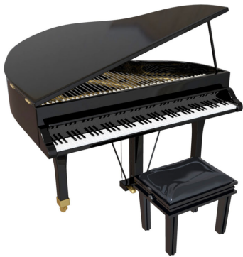
Sonata in C KV 545 7