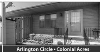
Arlington Circle • Colonial Acres