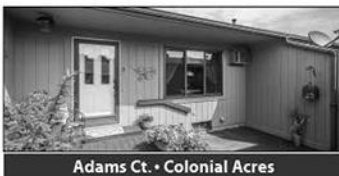
Adams Ct. • Colonial Acres

"We offer a competitive listing fee that we know would excite any seller"