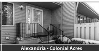
Alexandria • Colonial Acres