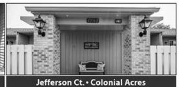
Jefferson Ct. • Colonial Acres