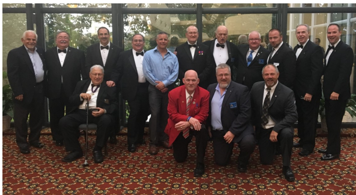
Council well wishers with the new Sir Knights after the Exemplification