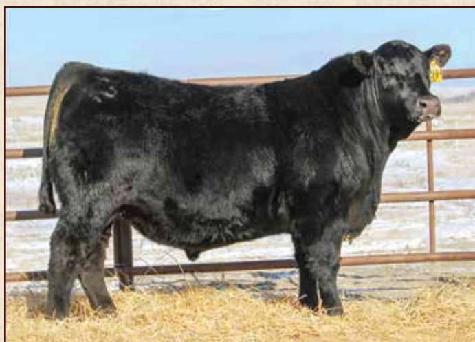
S R Blackcap 702 is the dam of S R Resource 415, the second high-selling lot of our 2015 Angus Bull Sale.