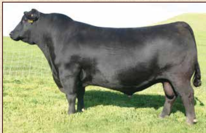
S A V Priority 7301

This higher-performing Connealy Mentor 7374 daughter posted a personal WR: 101 in the Reich program and also posted a UREA ratio of 118. Her dam, by the proven performance sire LT Territory 5824 of EA, logs a progeny record of UREA: 3/106. Due 3/4/17 to Connealy Capitalist 028, bull calf.