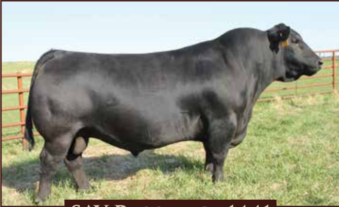
SAV RESOURCE 1441