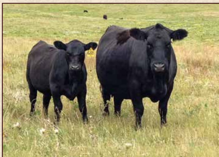
S R Burgette 031 as a 6-Year-Old pictured with her 2016 calf.

S R Burgette 031 may be one of the top donor-cow prospects to ever come out of the Strommen Ranch herd. Her flawless weaning record of 5/110, with a 365-day calving interval, puts her at the top. This massively constructed female comes from a dam that logged a progeny record of WR: 3/109 and stems from a Pathfinder granddam that logged a progeny record of WR: 3/111. S R Burgette 031 has stuck first-cycle A.I. every year of her life, proving her fertility. She raised an SAV Resource 1441 heifer calf that is certainly at the top of 2016 heifer calf crop. The mating to Sinclair Emulation XXP is truly one of the most exciting matings to sell in this sale. She is one to build a program around. Due 3/14/17 to Sinclair Emulation XXP, heifer calf.