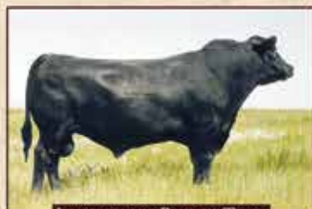
LEACHMAN RIGHT TIME