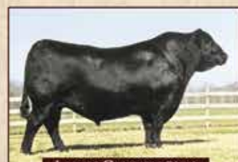
LARKS CANYON 74D4