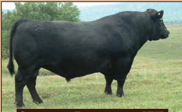
SINCLAIR EMULATION XXP