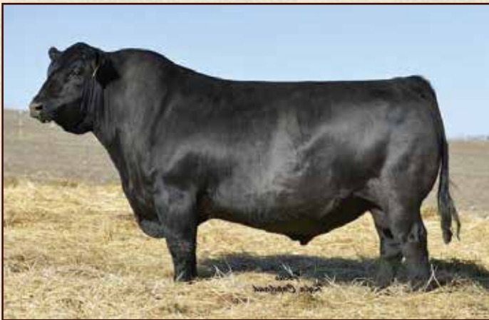
Basin Payweight 1682