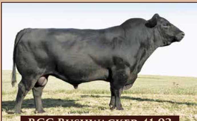
BCC BUSHWACKER 41-93