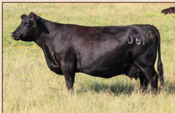
LOT 50 • S R POLLY 061