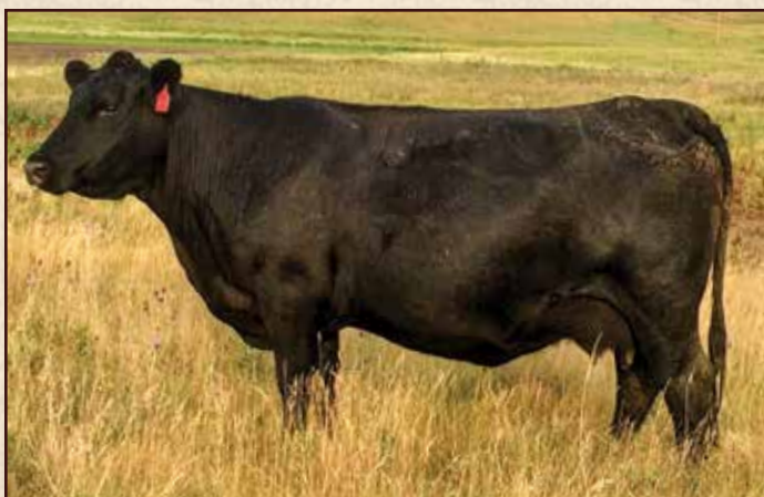
LOT 33 • BRUSETT BLACK LADY X95