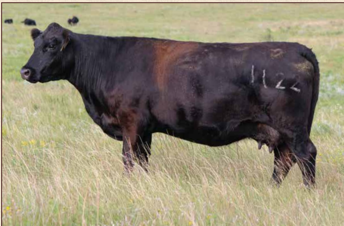
LOT 39 • DR EMMA 1122