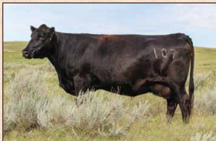
LOT 30 MISS WIX 107 OF CIRCLE V