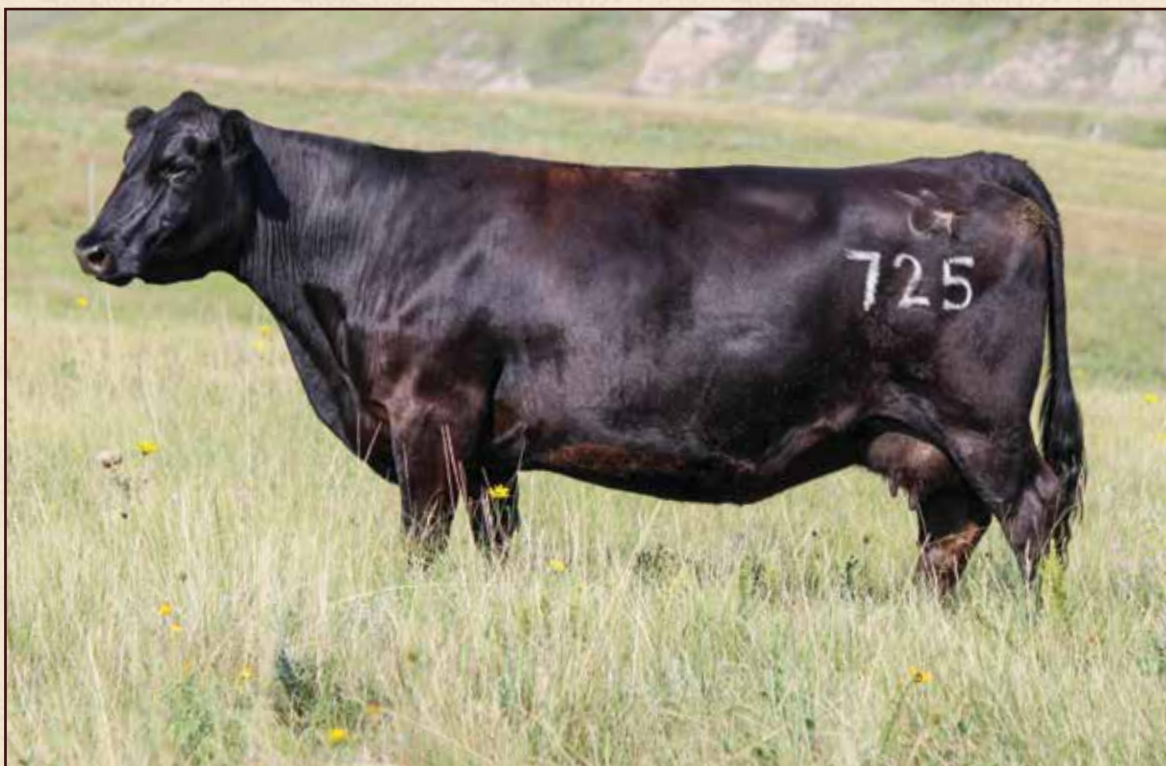
LOT 26 • S R CLOVA PRIDE 725