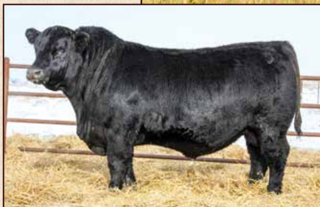
This 2-Year-Old son of Lot 49 and S A V Resource 1441 sold for $7,000 in our 2016 Angus Bull Sale. His dam is ultrasound-safe with another bull calf by Resource for 2017.