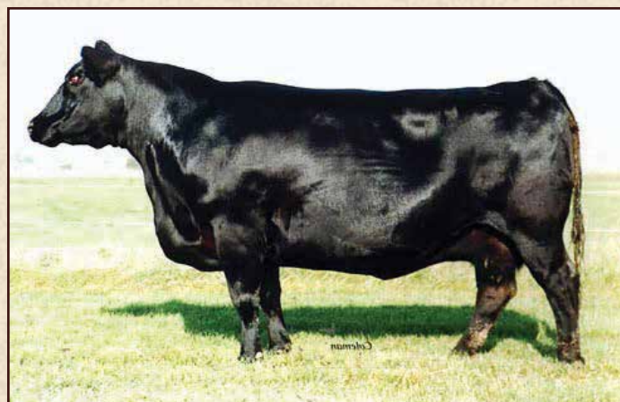
V D A R Beauty 50 is the maternal great granddam of Lot 37 and granddam of Lot 38.