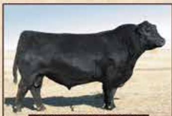
GDAR GAME DAY 449