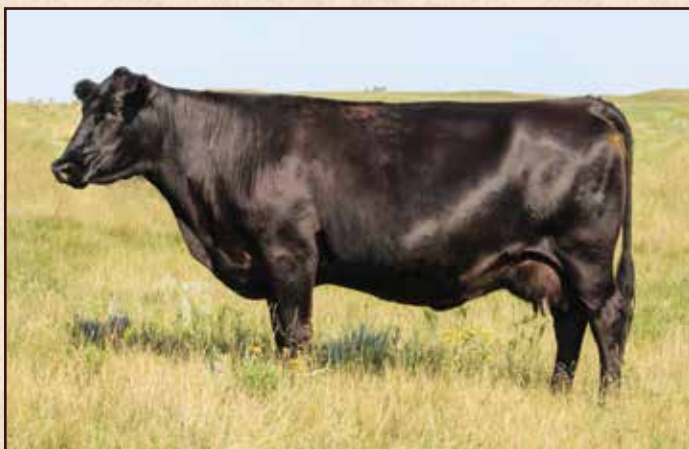
LOT 9 BLACKCAP 146 OF CIRCLE V

Here is a Pathfinder daughter of Alliance 904 from the Miss Wix cow family that carries a production record of WR: 4/107 with a 366-day calving interval. Her dam posts a progeny record of WR: 8/101. Hard to go wrong with these 904 daughters. 129 weaned a Resource bull calf this year that ratioed 111. Due 3/14/17 to S A V Resource 1441, heifer calf.