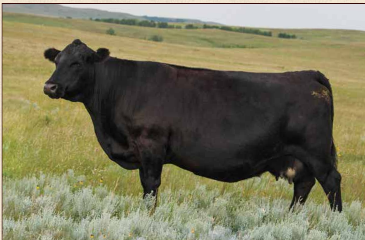
LOT 19 S R DOROTHY IDEAL 825