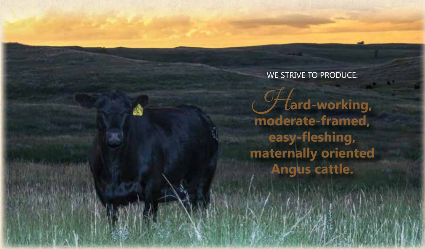
S R Dorothy Ideal 824 is an O C C Great Plains 953G daughter that sells as Lot 22 in this sale.

Hard-working, moderate-framed, easy-fleshing, maternally oriented Angus cattle.