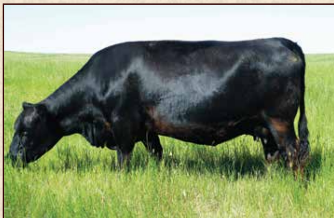
S R Betty 512 is the dam of S R Alliance 904, sire of Lots 5-10.

Here is a high-maternal bred female with the foundation genetics of Alliance, Emblazon, New Trend and Tehama Bando 155. Due 4/22/17 to Double R Bar Rito A116,