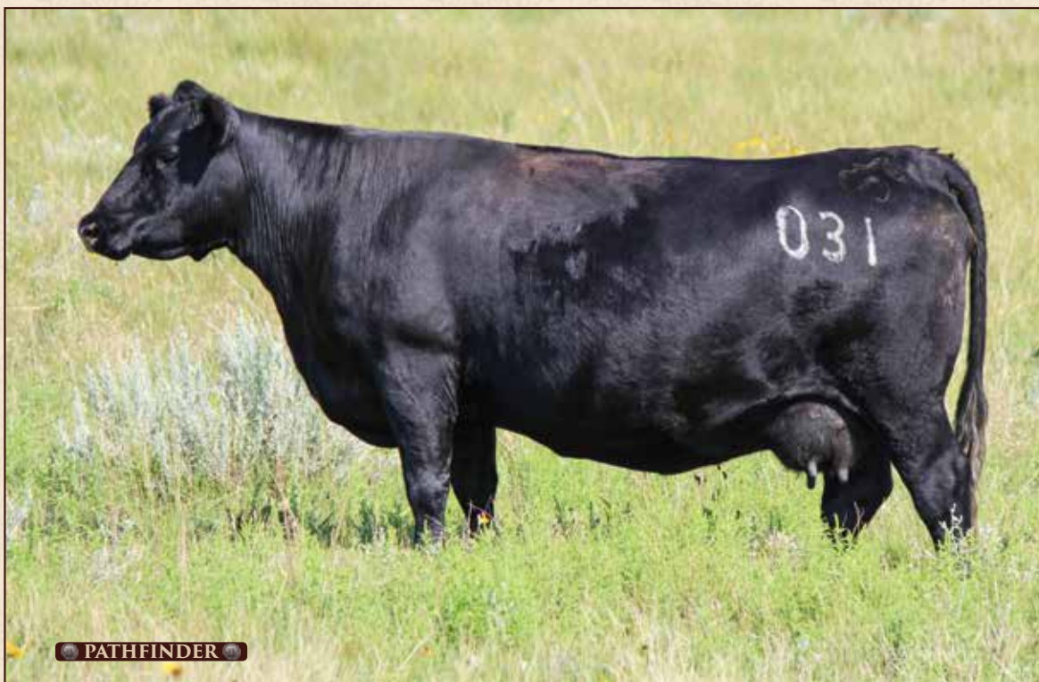
LOT 1 ● S R BURGETTE 031