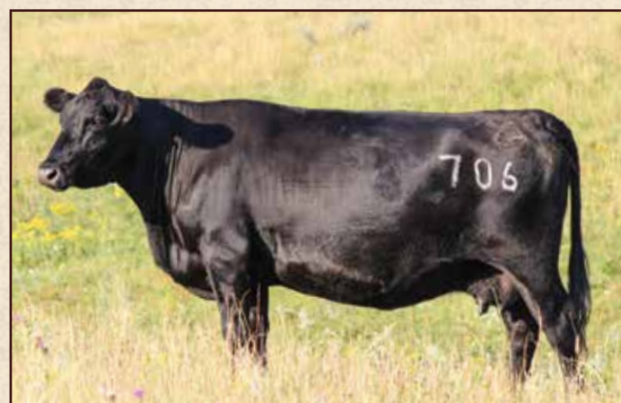
LOT 18 ● S R BEAUTY 706

Here is a Right Time female that has stuck to her A.I. service for the last seven years, with a calving interval of 8/362. She has a progeny record of WR: 8/101 with a 362-day calving interval. Her O C C Exodus dam has a progeny record of WR: 9/103. Her 2016 Resource bull is retained for the 2017 Strommen Ranch Angus Bull Sale and logged a WR of 106. Due 3/12/17 to S A V Resource 1441, bull calf.