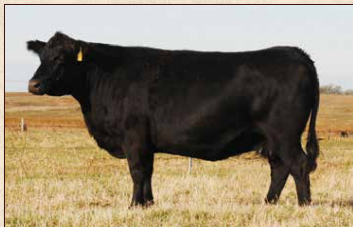
Basin Clova Pride 933, a Spickler Ranch donor cow, is the dam of Lots 27 and 28.

Owned by Finke Cattle. This type of female should probably never leave the ranch. This Spickler-bred female has a progeny record of BR: 3/87 and WR: 3/101. She has a son working for the Varty Ranch. 263 is a full sister to Lot 28. Due 2/28/17 to S A V Resource 1441.