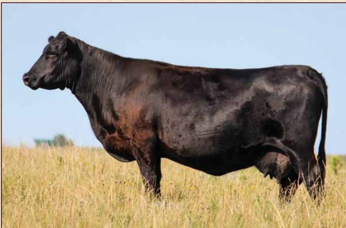
LOT 13 • S R LUCY 951