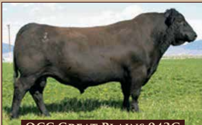
OCC GREAT PLAINS 943G