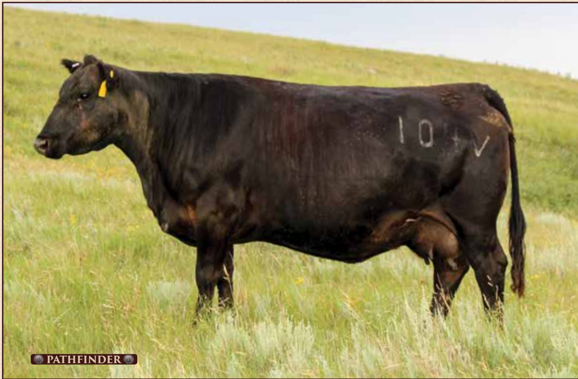
LOT 5 • LASSIE 104 OF CIRCLE V