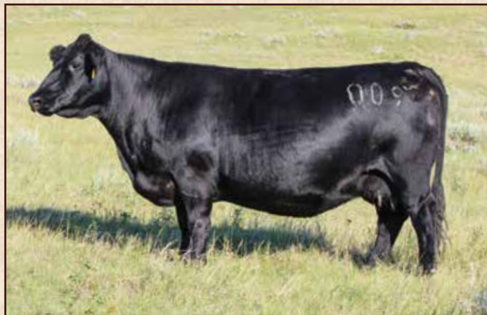
LOT 12 • S R ELDORENE 009

This beautiful, light-birth Paxton daughter from the Eldorene cow family should be on your list. Her low-birth Bushwacker dam is out of our foundation Eldorene 712 cow. Calving interval of 5/366 and a progeny record of WR: 4/104. Due 3/14/17 to Sinclair Emulation XXP, bull calf.