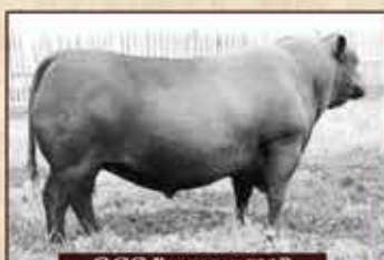
OCC PAXTON 730P