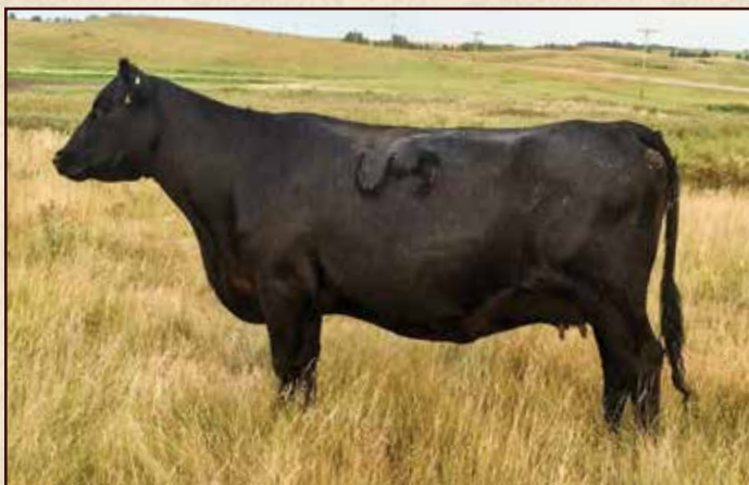
LOT 35 • BRUSETT BLACK LADY Z25