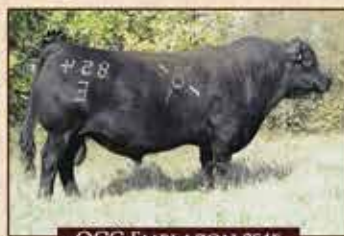
OCC EMBLAZON 854E