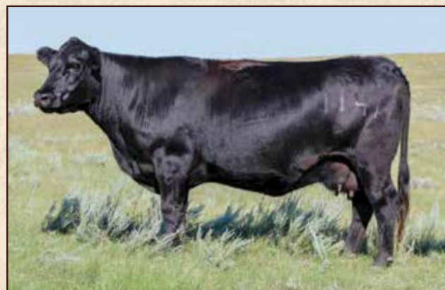
LOT 32 ERIANNA 1141 OF MCCUMBER

Here is a really nice-made cow from the Miss Wix cow family at Mc Cumber. 107 is near-perfect uddered with a 354-day calving interval. Due 4/27/17 to Multi-sire.