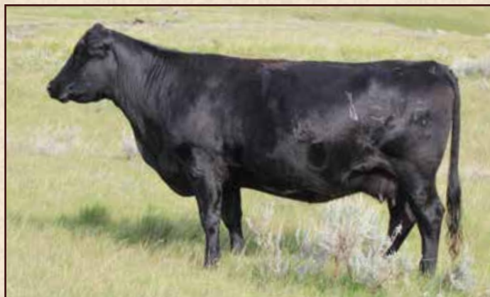
LOT 40 • DR BLACKKBIRD 157

A Gale from the McCumber program that has a progeny record of WR: 3/104. She raised a 648-pound Resource ET heifer in 2016 and logs a 365-day calving interval. Due 4/9/17 to Multi-sire, bull calf.