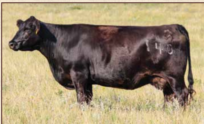
LOT 43 S R ERICA ENERGY 140