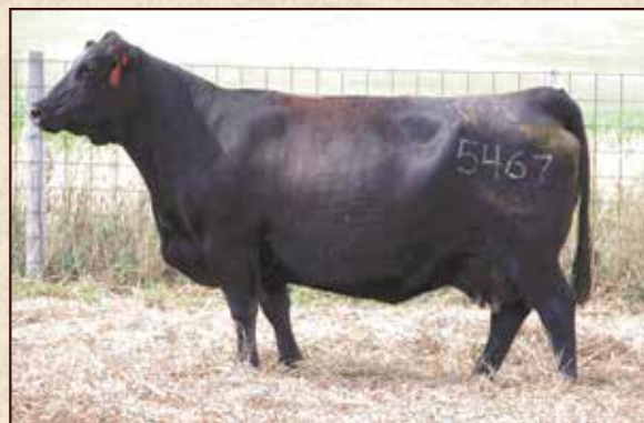
Ideal 5467 of 6807 7211 is the dam of Lot 24 and the granddam of Lots 19-21.

This long-bodied, sleek-fronted Great Plains daughter is carrying the service of Resource with a first-cycle heifer calf. She has a calving interval of 359 days. She is a unique combination of the Ohlde and Jorgenson programs. Due 3/12/17 to S A V Resource 1441, heifer calf.