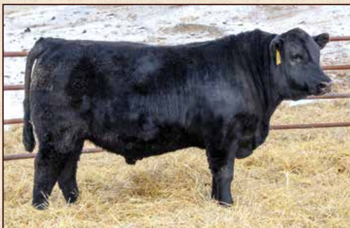
This son of 808 sold in our 2016 Angus Bull Sale.

808 is another example of the Alliance x Emblazon combination that has worked so well here. She posts a progeny WR: 7/104 and stems from a dam with a progeny record of WR: 9/100. Due 4/27/17 to Multi-sire.