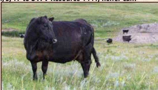
Lassie 104V of Circle V

A true donor cow prospect, Lassie 104 is a member of a tremendous set of half-sisters out of a Strommen Ranch-raised bull, S R Alliance 904. This Pathfinder female sports a progeny record of WR: 4/112 and YR: 3/108, with a 363-day calving interval. She is out of dam that recorded a progeny record of WR: 7/106 and YR: 7/105. This year, 104V raised an outstanding Resource bull calf that ratioed 106 and will sell in the 2017 Strommen Ranch Angus Bull Sale. Her first three calves were all bulls, selected by some of the top commercial cattlemen in the region. 104V has stuck every year to A.I. service, proving her capability to raise top-of-the-pen calves, while still maintaining her fertility. This female ties the traits together that are needed for profitable, real-world beef production. Dam's production record was WR: 7/106 and YR: 7@105. Due 4/3/17 to S A V Resource 1441, heifer calf.