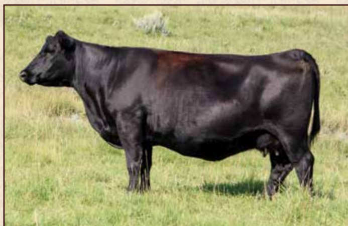
LOT 20 S R DOROTHY IDEAL 011