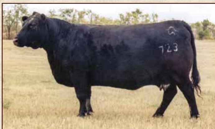
M H Beauty 723 is the dam of Lot 38, SRF Beauty 901W of FCC.

Owned by Finke Cattle. A direct daughter of the legendary female producer Leachman Right Time. 901W was one of the original Angus females born here and her 6807 dam left many wonderful progeny both here and at Strommen Ranch. Due 3/01/17 to S A V Resource 1441, heifer calf.