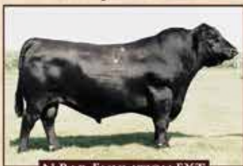
N BAR EMULATION EXT