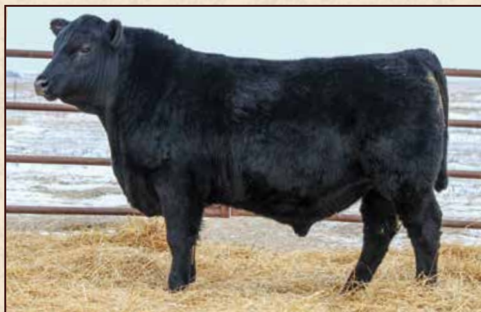
This son of S R Eldorene 966 was another high-selling lot in our 2015 Angus Bull Sale.

Eldorene 966 has certainly earned her spot as one of our favorites. She is a massively constructed Outfitter daughter that has a WR: 6/101 and with a 366-day calving interval. Her calves have a average birth weight of 84 pounds. Her deep-bodied, easy-fleshing Pathfinder dam, who posts a progeny record of WR: 6/108, stems from our productive foundation Eldorene 712 cow. 966's mating to Sinclair Emulation XXP should definitely draw some interest! Due 3/17/17 to Sinclair Emulation XXP, heifer calf.