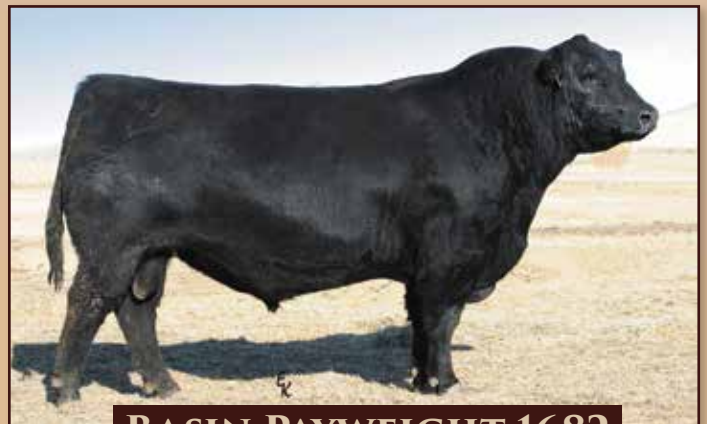
BASIN PAYWEIGHT 1682