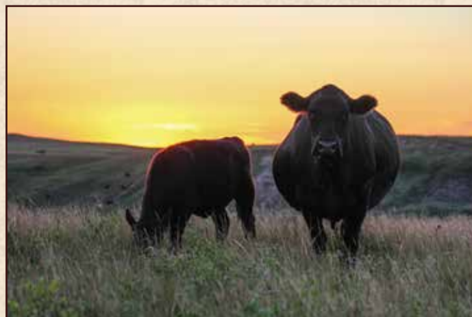
Sunset on the ranch is one of our favorite times.

Here's another cow we really like. She has a production record of BR: 9/99 and WR: 9/103, with a 361-day calving interval. Her dam was a tremendous cow from the Luhman herd and had a progeny record of WR: 11/101. Due 4/1/17 to S A V Resource 1441, heifer calf.