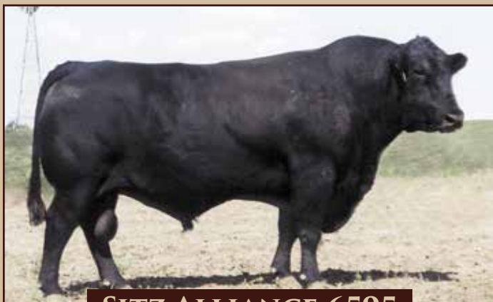
SITZ ALLIANCE 6595