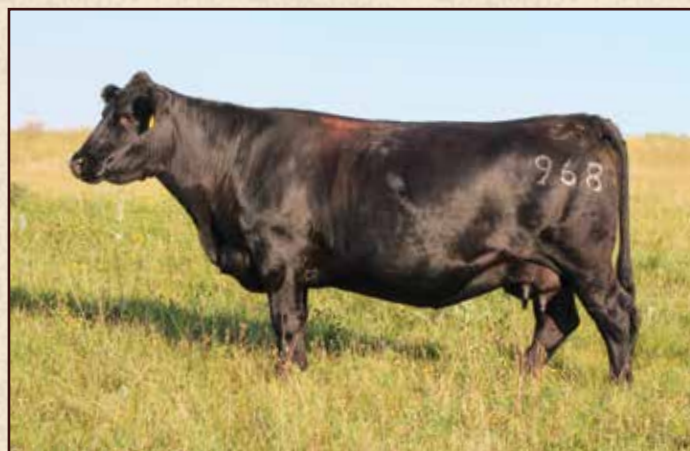
LOT 23 • S R DOROTHY 968