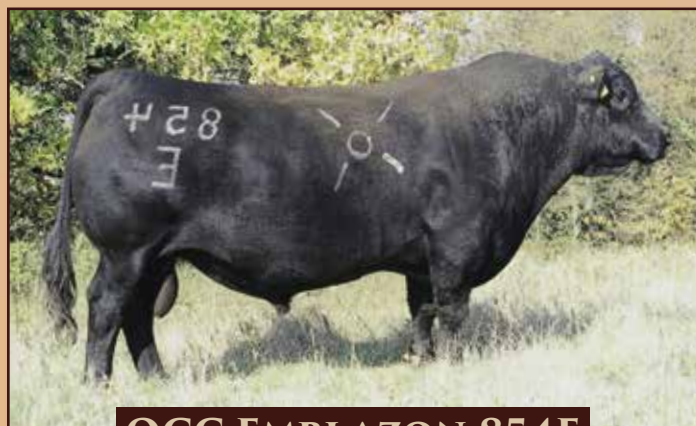
OCC EMBLAZON 854E