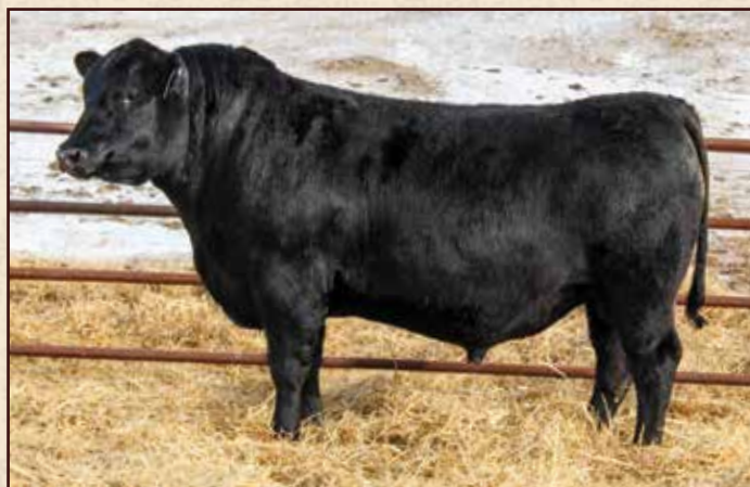
This 2-year-old son of S R Lucy 319 sold in our 2016 Angus Bull Sale.

This low-birth Lucy female carries a progeny record of BR: 6/98 and WR: 6/102. She stems from a Pathfinder dam that had a progeny record of WR: 6/104 and a Pathfinder granddam that achieved a progeny record of WR: 10/101. Due 4/20/17 to Multi-sire.