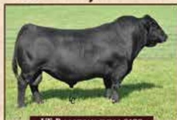
IT BANDWAGON 3105

These proven, balanced, female-makers are the backbone of our cowherd.