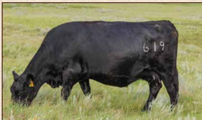
LOT 46 S R ENCHANTRESS 619

S R Blackcap 304 is a direct daughter of the female selling as Lot 44. This Revival daughter has an individual WR: 117 and is from a dam that has a progeny record of WR: 2/111. Due 3/13/17 to Connealy Capitalist 028, heifer calf.