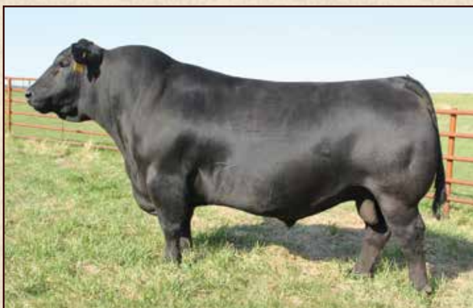
S A V Resource 1441