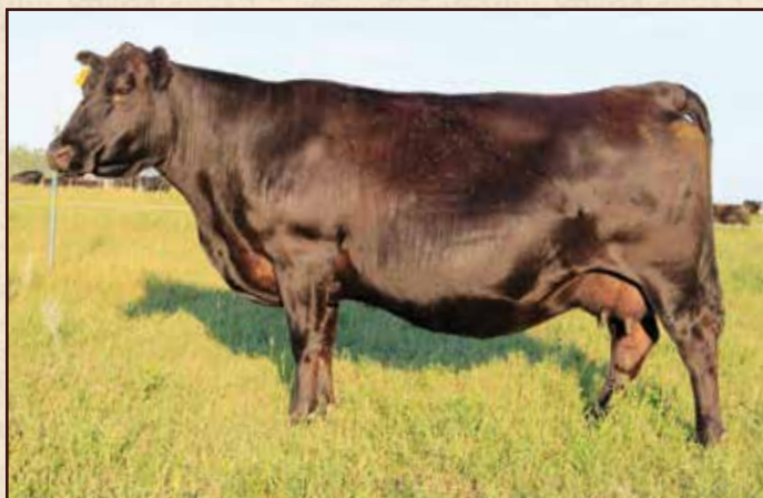
LOT 14 • S R LUCY 319

This one is hard to let go. She has been one of my favorite cows for years. She has a calving interval of 12/366 and a calving-ease foundation pedigree. Perfect udder, easy keeping and has been good for years. She comes from a perfect-uddered dam that also had 12 calves recorded. Due 4/1/17 to Double R Bar Rito A116, bull calf.