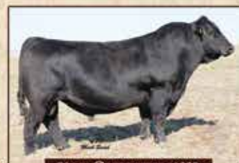
ZIAR OUTFITTER 6032