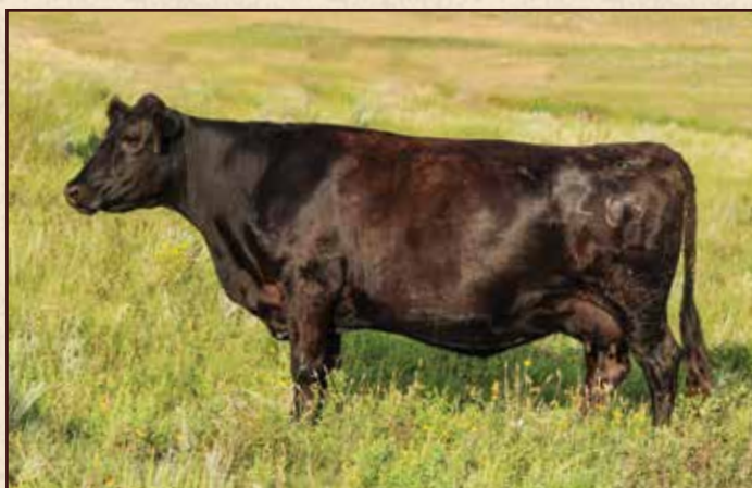
LOT 29 MISS WIX 1209 OF MCCUMBER