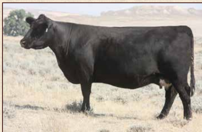
LOT 34 • BRUSETT FOREVER Q742

Owned by Finke Cattle. The 742 female was purchased out of the Brusett dispersal in Montana for her outcross genetics and extreme low birth weight potential. She has recorded a BR: 7/89. We have retained several daughters by this foundation cow. Due 3/01/17 to S A V Resource 1441.