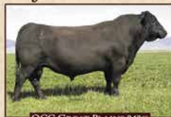
OCC GREAT PLAINS 943G