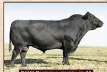
BCC BUSHWACKER 41-93