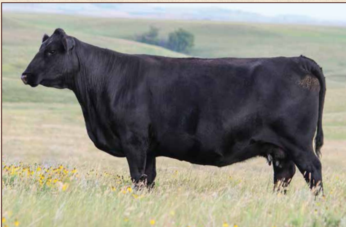
LOT 11 • S R ELDORENE 966