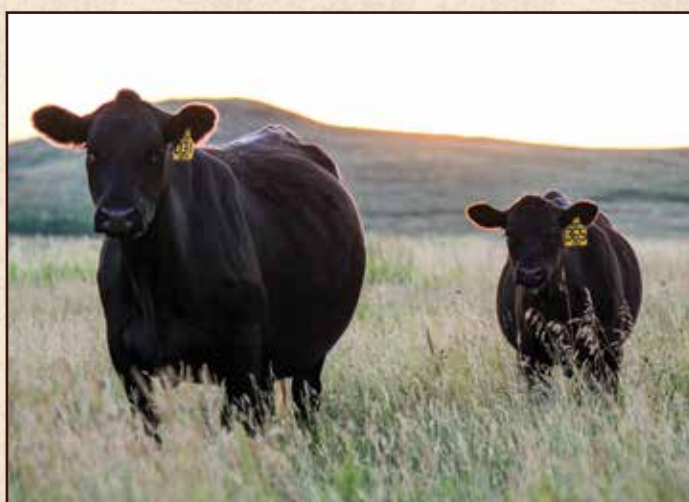
S R Burgette 031 as a 3-Year-Old pictured with her 2013 calf.