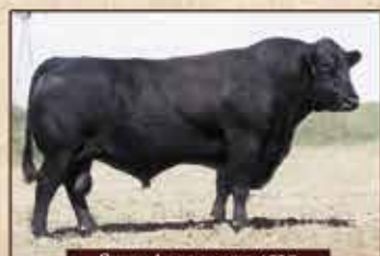
SITZ ALLIANCE 6595