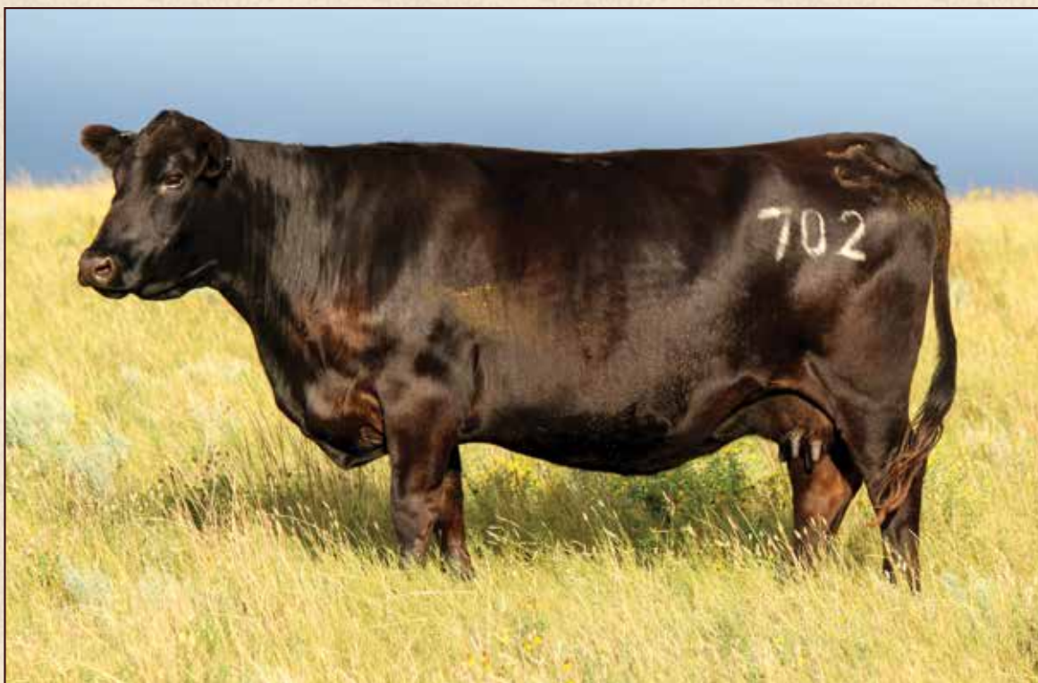
LOT 2 • S R BLACKCAP 702