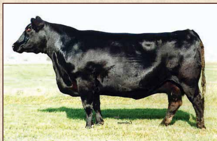
V D A R Beauty 50 is the grandam of Lots 17, 37 and 38.

A proven Beauty cow out of the Ohlde herdsire, Emblazon. She has stuck to A.I. service for the last eight years and is a granddaughter of the great Beauty 50 cow. Due 3/13/17 to Sinclair Emulation XXP, bull calf.