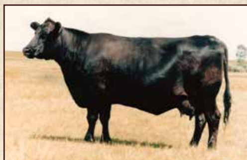
Miss Wix 365 of McCumber

1165 has never been bred by a bull. She has always taken to her A.I. service date. This low-birth Miss Wix is carrying a Resource bull calf. Due 3/13/17 to S A V Resource 1441, bull calf.