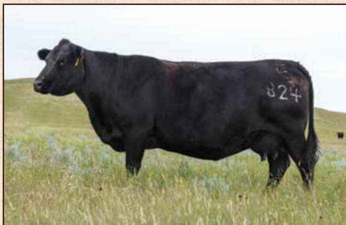
LOT 22 • S R DOROTHY IDEAL 824