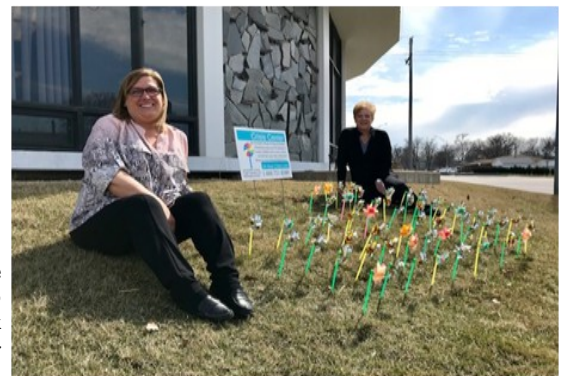
Pictured are pinwheels set up at the U.S. Bank in Blair

We have launched our pinwheels outreach with the help of our 5 county community members. Each pinwheel placed in the business' yard represents a child who has witnessed abuse in that county. This is an alarming realization when you see the number of pinwheels blowing in "silence". Outreach, communication, and knowing the signs will be a "force" to decrease these statistics.