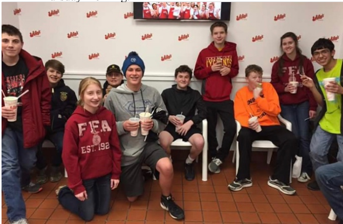
Fruit Sales sellers got to stop at Whitey's

It was an overall awesome fundraiser, but the fun didn't stop there! On January 22nd at 5:30 pm any and all FFA members that sold fruit were invited to go to the Helium Trampoline Park in Eldridge, Iowa. The whole chapter was invited, but only the members that sold fruit would have their way paid into the activity that night. The members all had awesome times jumping around and being active with their fellow FFA members.