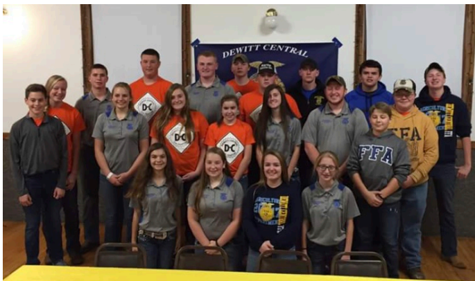
All of the FFA members who worked at Trivia Night