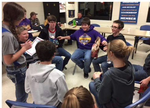
Members participating in the Christmas Party activities

On December 11, 2017, the DeWitt Central FFA hosted a chapter wide Christmas party. This year the party was combined with our monthly chapter meeting, where members could join the chapter in celebrating. At the Christmas Party there were fun games planned, one of the games was a white elephant gift exchange. Members were encouraged to bring a present so that they could participate and draw a gift of their own. The final gift of our Secret Santa gift exchange was to be given during the party. Members were to guess who their secret Santa was and then had the opportunity to thank them. Other fun and