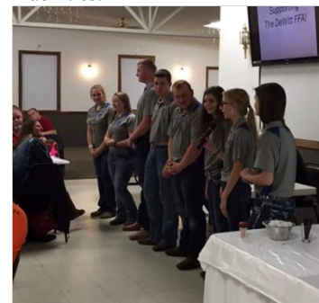
The officer's introducing themselves to the guests