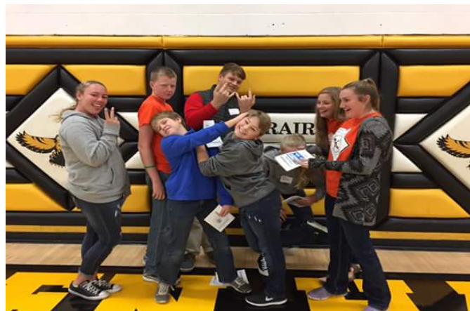
The Greenhands having a blast at Mid-Prairie

balancing priorities, communication, and FFA opportunities – in order to provide the first-year FFA members with skills they would use both within and outside of FFA. The goal was to engage FFA members in learning about the tools that would allow them to be successful in anything they are part of through high school and beyond.