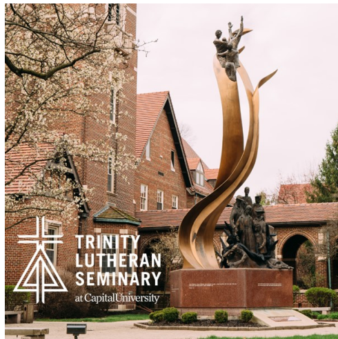
Trinity Lutheran Seminary, Columbus, Ohio, is one of seven ELCA seminaries. Every time you give an offering to First Lutheran, a part of your gift goes to support theological education and train pastors for the leadership of this Church!

The ELCA has seven seminaries: Luther Seminary [St. Paul, MN], Lutheran School of Theology [Chicago], Trinity Seminary [Columbus, OH], Wartburg Seminary [Dubuque, IA], United Seminary [Philadelphia and Gettysburg, PA], Lutheran Southern Seminary [Columbia, SC], and Pacific Theological Seminary [Berkeley, CA].