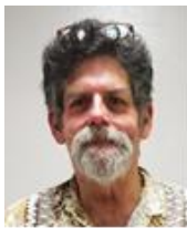
Snack King Avilidorable