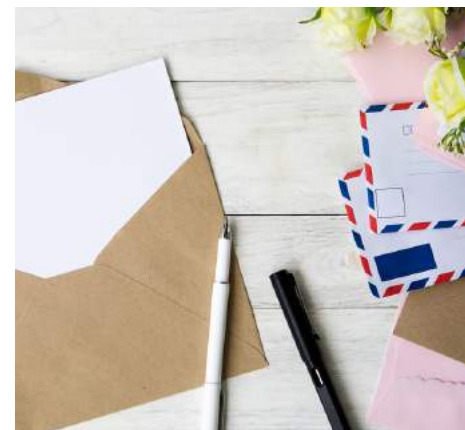
Good words for Great Starts

WALPN requests that if you make a change in your address, phone number or email that you send this change of information to the NALPN office @ nalpnoffice@gmail.com . We want to be able to always send you the latest newsletters for WALPN and NALPN, and current updates.