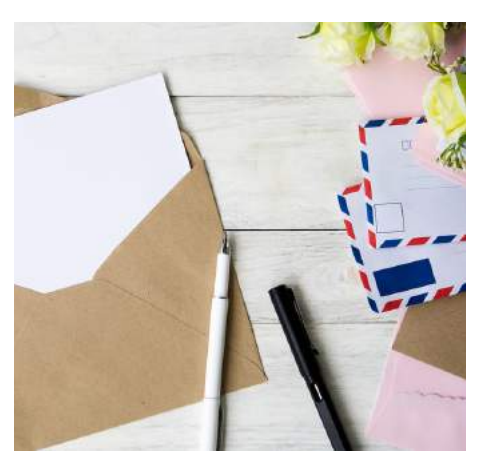
Good words for Great Souls

WALPN requests that if you make a change in your address, phone number or email that you send this change of information to the NALPN office @ nalpnoffice@gmail.com. We want to be able to always send you the latest newsletters for WALPN and NALPN, and current updates.