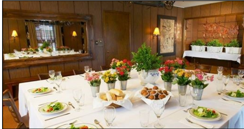
Hackney's on Lake Restaurant, Glenview, IL