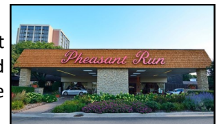
Pheasant Run Resort

We need your help! All attendees will receive a registration packet. The registration packet has an itinerary, meal tickets, and other items about the meeting. We would also like to add some goodies to the packet. Do you work for a company that would be willing to donate items to the packets? It would be nice to show the diversity of the companies in Illinois.